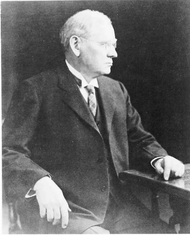
PIERCE BUTLER, associate justice of the Supreme Court, about 1925

fourth questioned Butler's fairness as a member of the University of Minnesota Board of Regents. 22