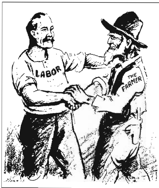
Syndicated cartoon from the May, 1918, issue of Gaa Paa