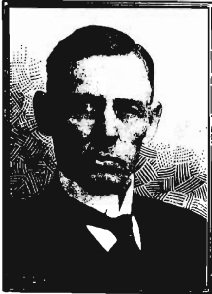
CHAS. A. LINDBERGH