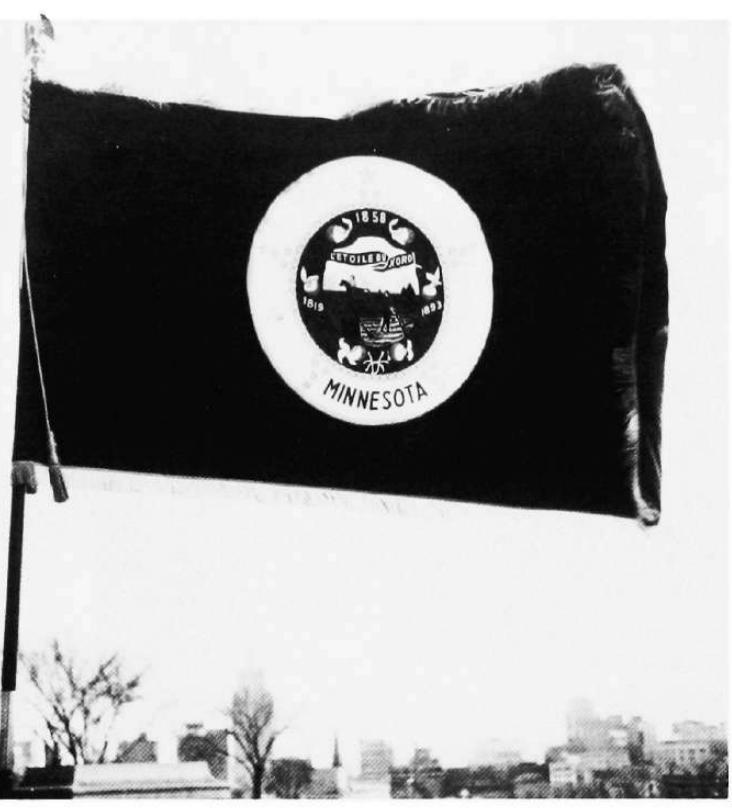
New state flag, flying over the capitol in St. Paul

teen eventually based their flags on regimental precedents. Connecticut's 1897 state flag followed the blue militia colors dating from the Civil War, bearing the state seal. Delaware's did much the same in 1913. In Idaho, the adjutant general ignored a design set by law in 1907 and established a state flag conforming to the colors carried by state military forces. Indiana in 1917 adopted a flag standardized according to the conventions of its militia. Militia flags provided the basis for an 1880 flag of the Kentucky State Guard, which in turn was the basis for the state flag in 1918. Maine's militia colors became official as the state flag in 1909: Michigan's early militia colors were standardized in 1865 and provided the model for the state flag in 1911; and the standard of the First Montana Infantry in 1898 was the basis of the 1905 state flag. In New Hampshire, a heritage of regimental colors from as early as 1792 governed the design of the state flag adopted in 1909; and New York's Revolutionary War colors inspired the design of its state flags in 1858, 1896, and 1901. North Dakota's militia flag, based on the U.S. Infantry regimental color, became the state flag in 1911. Vermont's flag of 1923 and Oregon's of 1925 were both based on militia colors. And, lastly, Wisconsin's state and militia