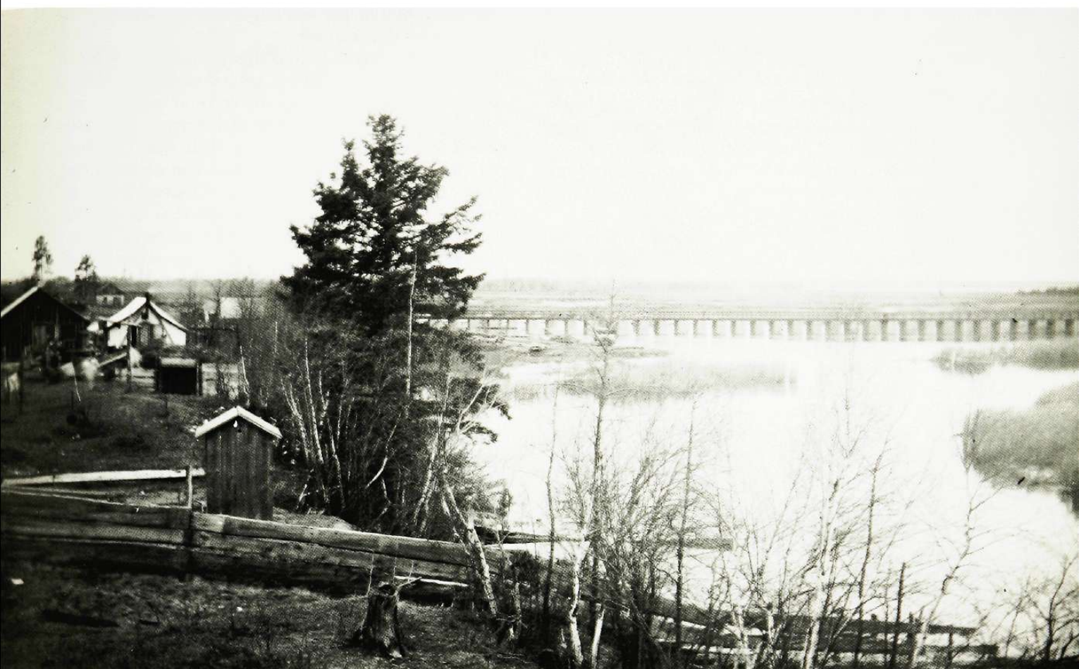
Leech Lake dam, about 1902, as documented by a U.S. Army Corps of Engineers photographer

predictable. The government needed to regulate the flow and action of the Indians for their own advancement and, not incidentally, that of the state.