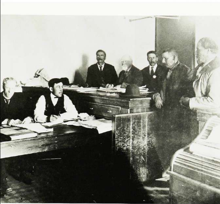
Ojibway men lining up for their land allotments, White Earth Indian Agency, 1890

then, that the works of a culture were only deemed worthwhile if they were marketable. Surviving or feeding one's family was not sufficient; rather, making a living was seen as advancing oneself along class lines through occupation.