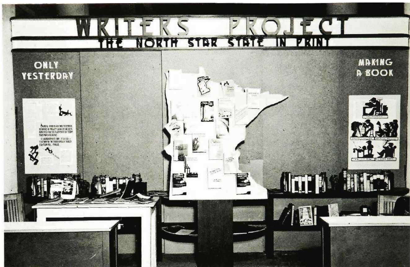
Promotional booth at the Minnesota State Fair. One poster boasted, "Colorful items in old-time newspapers, unearthed by project workers, are being reprinted for the enjoyment of today's newspaper readers."

At that time the writers' project in Minnesota had finished the state guide and one to St. Cloud, which by common agreement was embarrassingly bad. There were also a number of projects in various stages of completion: guides to the Arrowhead region and Roseau County; a children's history of the Indians of Minnesota; and a history of the St. Croix River. Under Ulrich's successors the work intensified, at least for a brief period. By the end of 1938 the state guide was published, the Arrowhead manuscript was complete (it was published in 1941), and two of the county histories were distributed in mimeograph form. There were more than two dozen new ventures planned, including several regional, economic, and ethnic studies, a number of encyclopedic works, and—now that Ulrich was gone—a folklore project. Drastic budget cuts in early 1939 forced the cancellation or delay of most of these proposals, and even though the writers struggled along, most of the remaining work was incomplete when the WPA arts program was finally terminated in 1943. 26