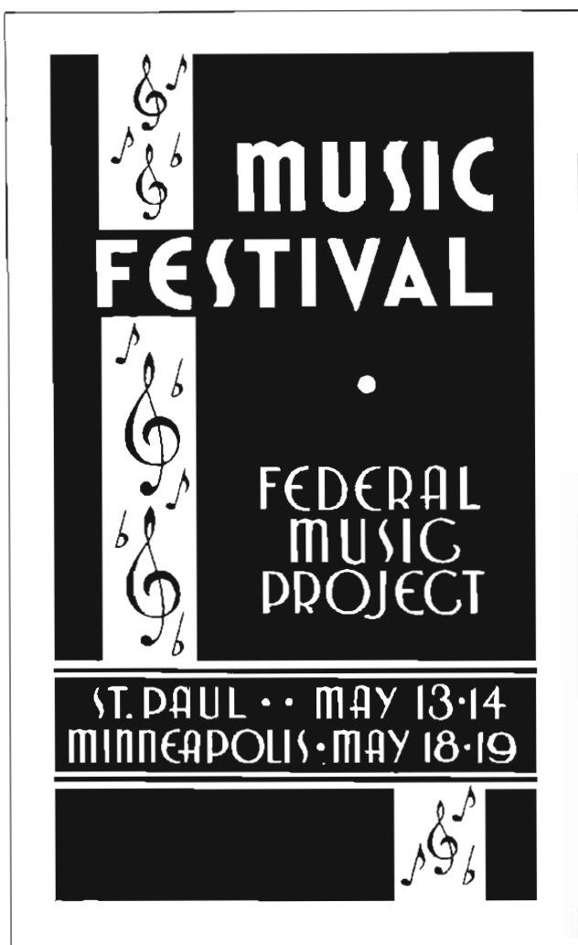
Program booklet, about 1937, for a series of performances by three Twin Cities groups: the Jubilee Singers, civic orchestra, and band. Local churches hosted this round of free concerts.

throughout the lifetime of the project and achieved some notable successes. 12