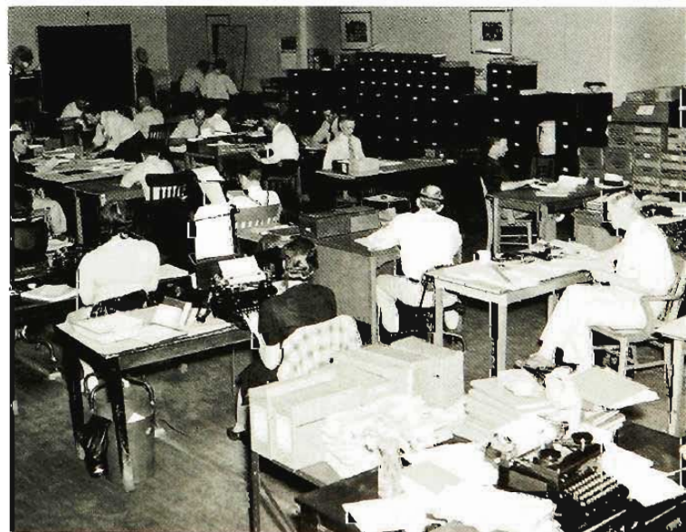
Minnesota writers at work in their crowded office as the project was winding down, 1943