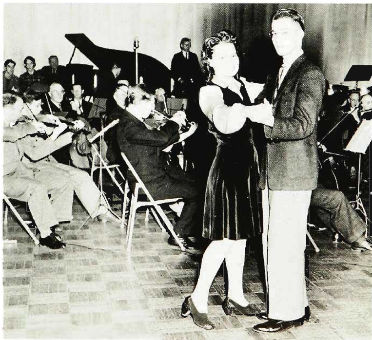
Young couple posing with a WPA dance band