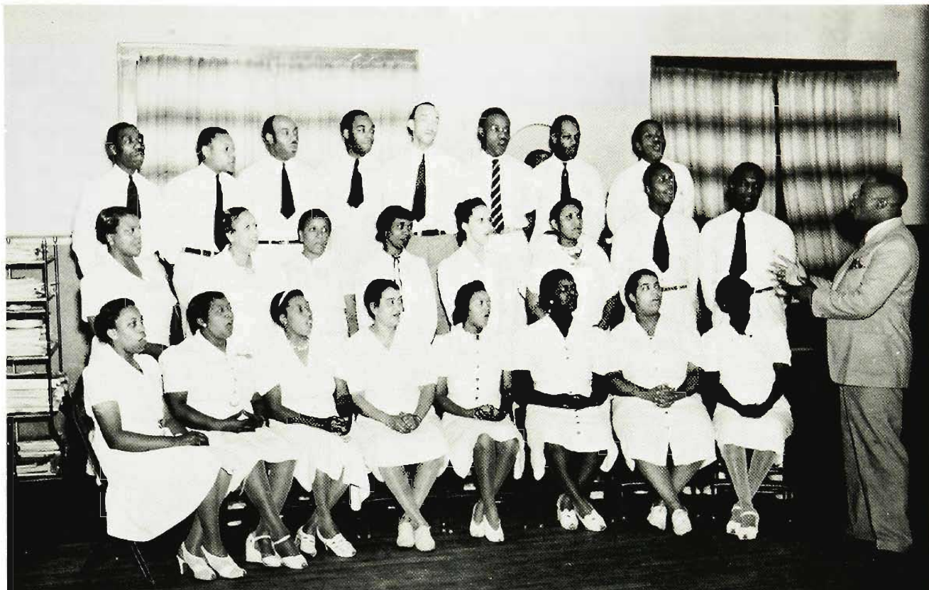
Twin Cities Jubilee Singers, St. Paul, rehearsing about 1940. The group's repertoire included such favorites as "Wade in the Water," "Let My People Go," and "Swing Low Sweet Chariot."

luth, Virginia, and the Twin Cities made numerous appearances and were widely praised. When, in 1937, it was decided to terminate the radio broadcasts by the Virginia group, there were noisy protests. The teaching component was smaller in Minnesota than in many states, but it served a relatively large clientele in the Twin Cities. Ten to fifteen teachers found employment and, in turn, provided lessons to several hundred people a month. 16