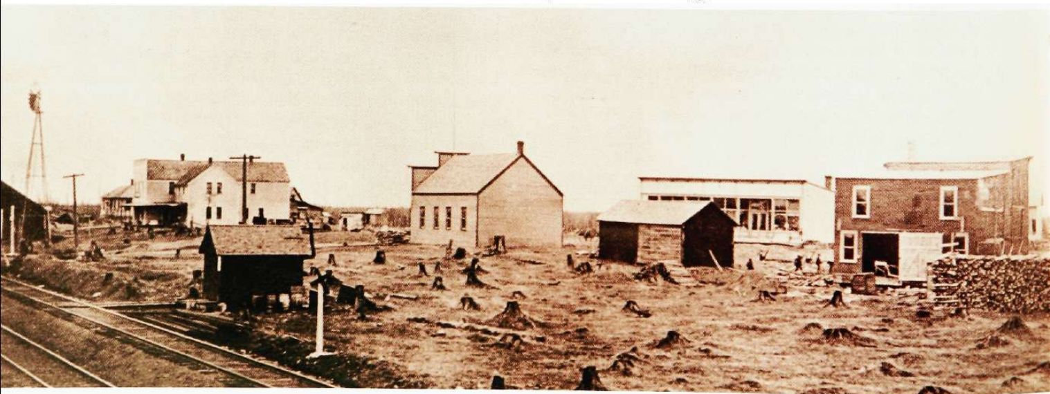
Partridge (renamed Askov), 1908, a Pine County hamlet on stumpy, cut-over timberland