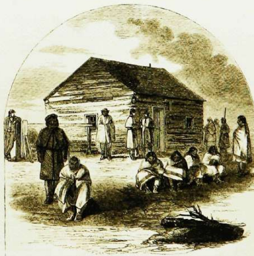
THE COURTHOUSE OF THE MILITARY COMMISSION.