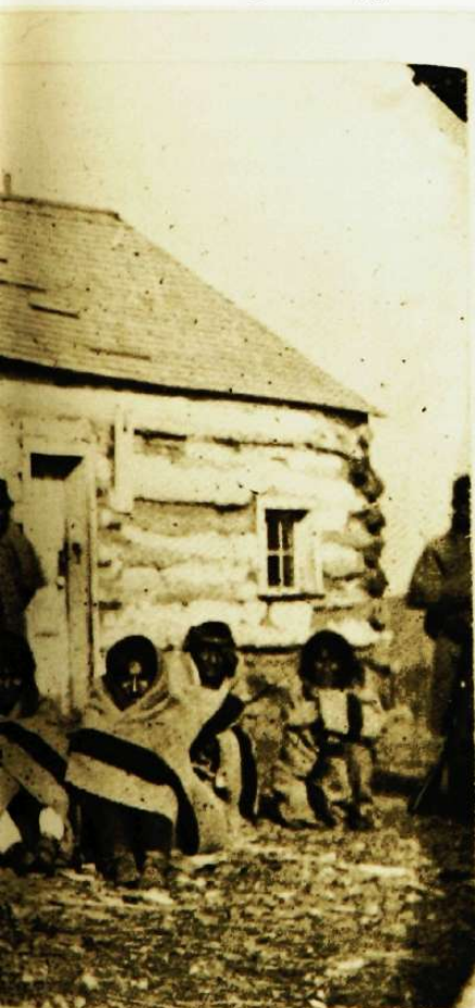
INDIAN JAIL. Prisoners in the foreground