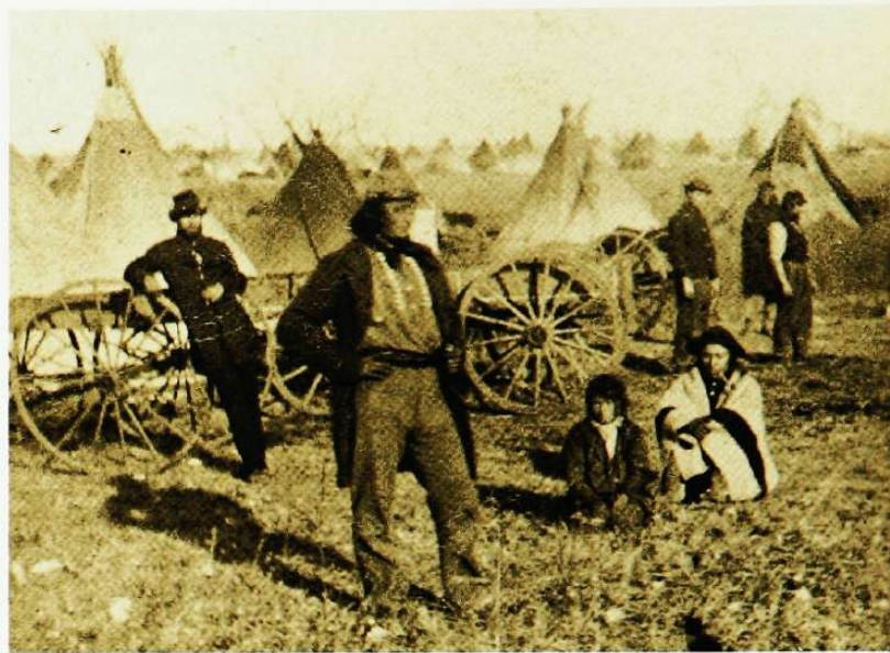
Soldiers guarding seated Dakota captives in late September at Camp Release in western Minnesota, a rare view from Ebell's personal scrapbook

By October 9, 1862, Ebell had written eight stories for the Daily Press , based on information