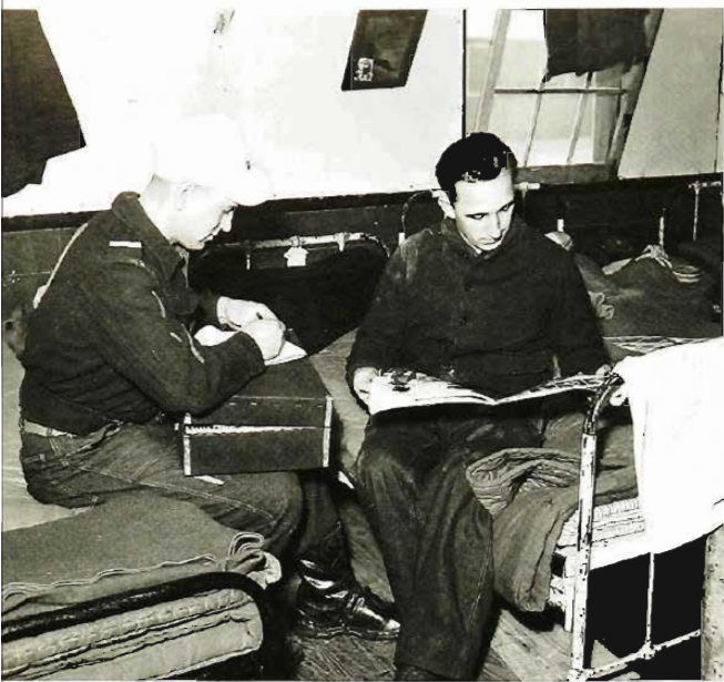
PWs in barracks at the Remer camp, 1944, similar to the sleeping quarters at Bena