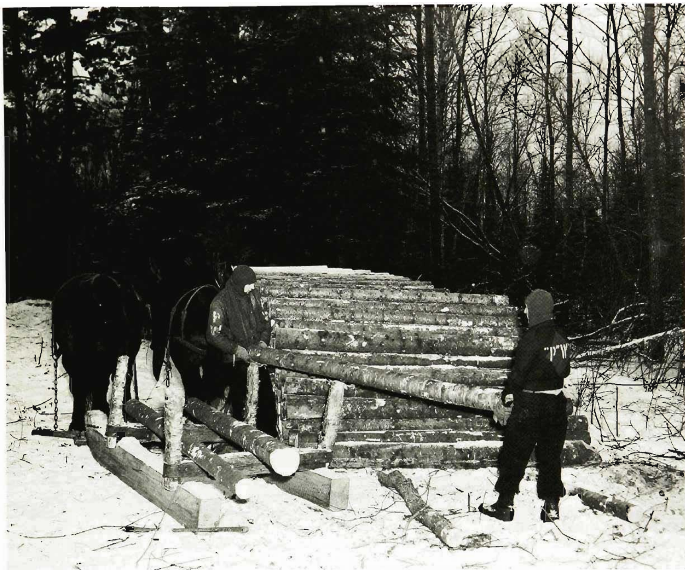
PWs in marked clothing loading logs on a sled near Deer River, 1945