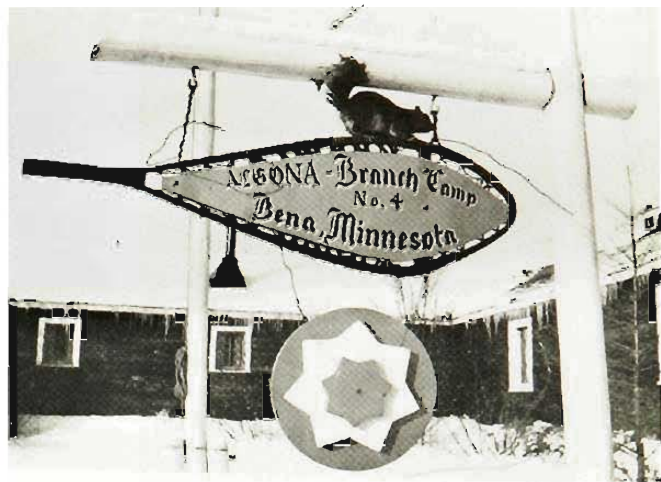
Snowshoe sign at the entrance to the Bena camp, 1944, including the seven-pointed-star emblem of Seventh Service Command, Omaha. Building in background is probably camp headquarters

The first prisoners assigned to work in Minnesota's timberlands arrived in Cass County near Remer on January 31, 1944, when an American lieutenant and 18 guards escorted 37