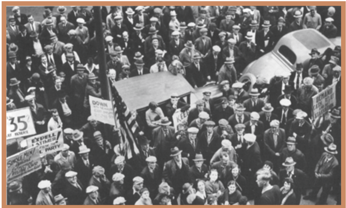
Crowd at an anti-Latimer rally, September 1935, protesting the mayor's relief plan as well as his “scabby employer-employee board”