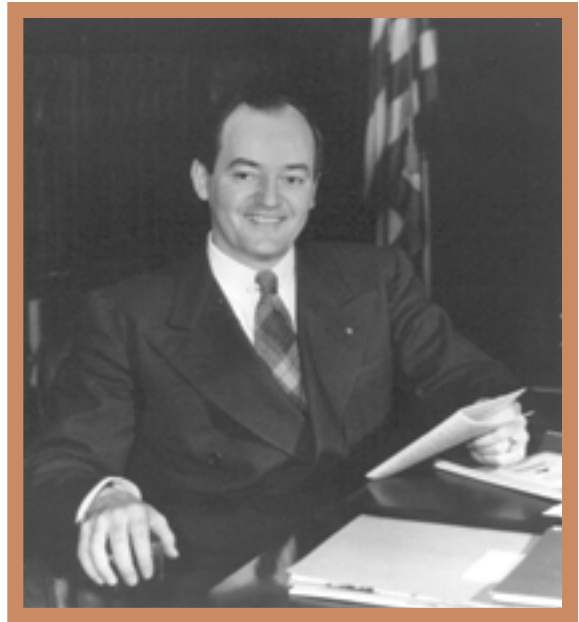
Hubert H. Humphrey about 1946, when he was mayor of Minneapolis