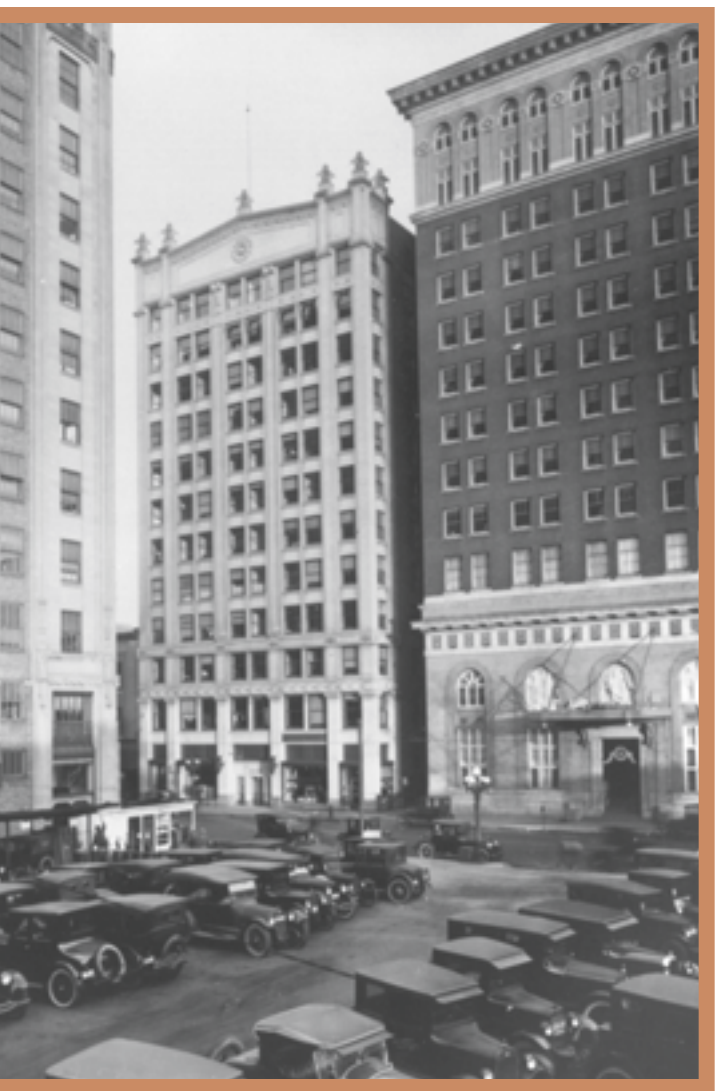
Builders Exchange building (left, facing Second Avenue) and its neighbor, the imposing Minneapolis Athletic Club, about 1920