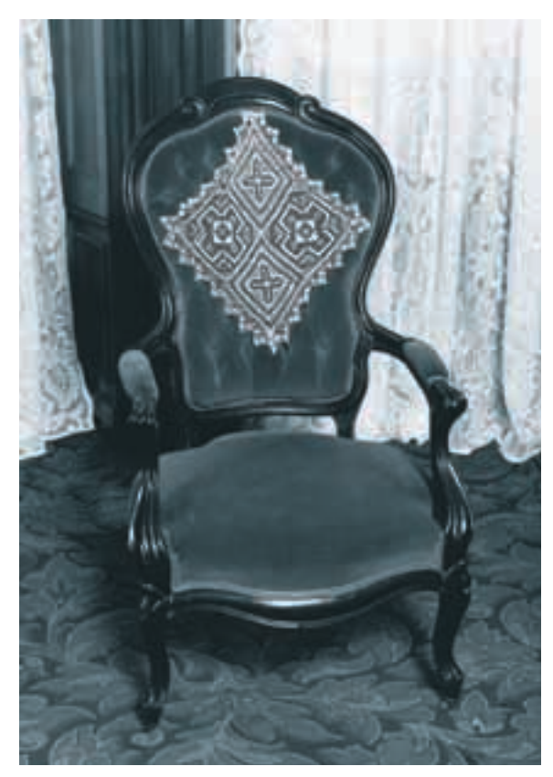
Rococo-revival armchair, part of the suite ordered from St. Louis in 1849, now in the library. Note the carpet, a reproduction of the original, and the antimacassar.

Publications promoted a variety of color schemes for the parlor: peach, rose, ethereal green, gold, greenish yellow, blue-green, low tones (dulled or grayed hues), twilight shades,