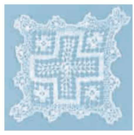
Antimacassar, Ramsey House

they acknowledged that "nine times out of ten . . . the library—so called—is also the smoking room, morning room, school room, or ante room"; therefore, it should be decorated not with the austerity of a "genuine library" but as a "pleasant and useful family room." Informality and comfort were the hallmark, produced by "quiet and unobtrusive" decoration. To achieve this effect in furnishings, the publications most frequently recommended somber tones