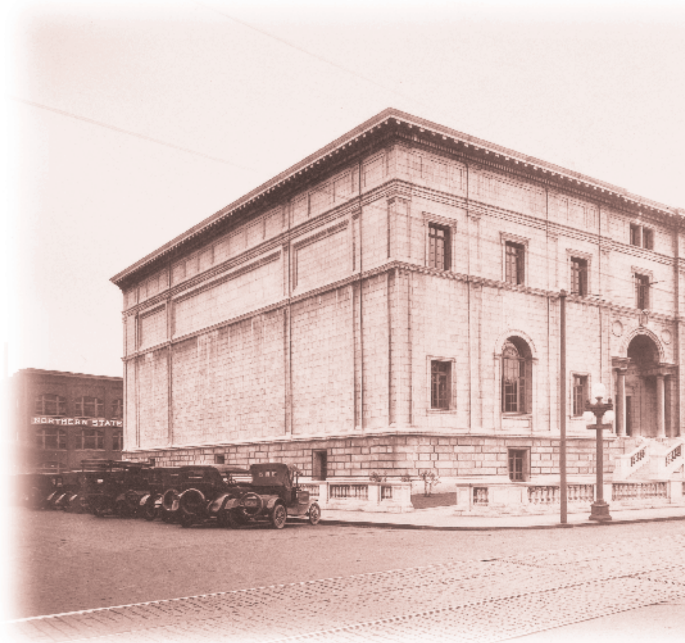
Finally opened in 1921, the Hill library (entrance at far left), adjoining the city's public library