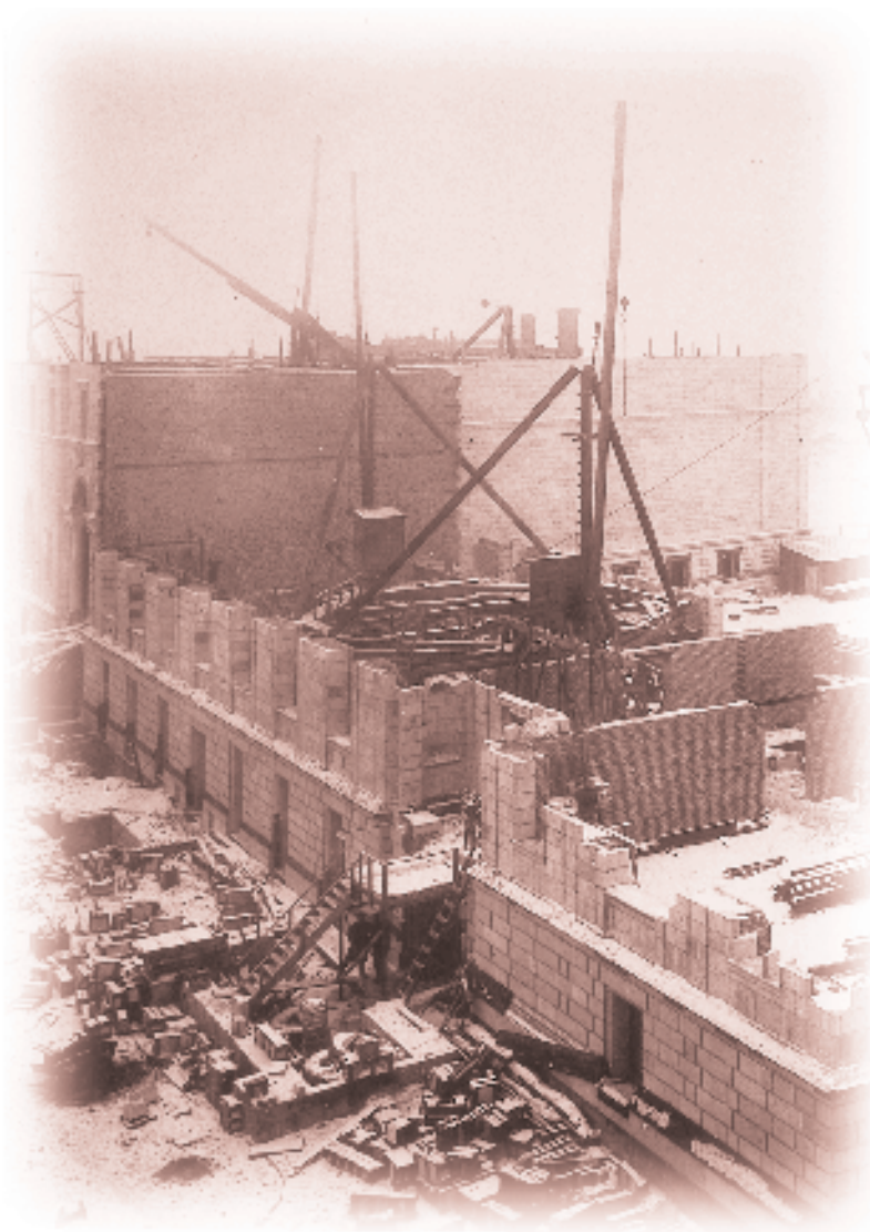
Hill library exterior (far left), January 1915, completed well before the St. Paul Public Library. The two institutions under one roof were built by different contractors.