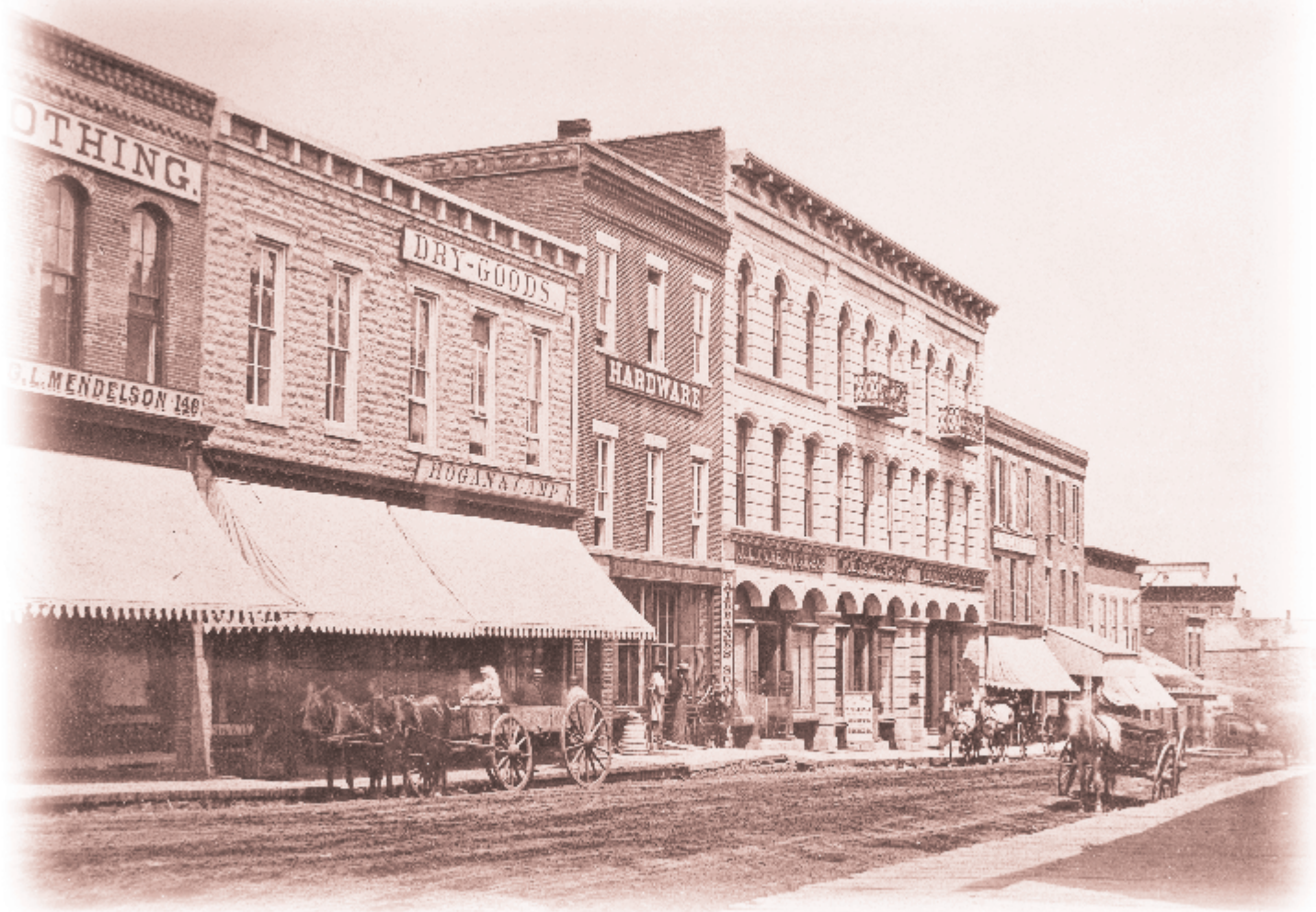
St. Paul in 1862, growing but still rough around the edges. Board sidewalks line unpaved Third Street between Minnesota and Robert.

period. In his personal life, Hill decided to settle down, marrying 21-year-old Mary Theresa Mehegan in 1867. 4