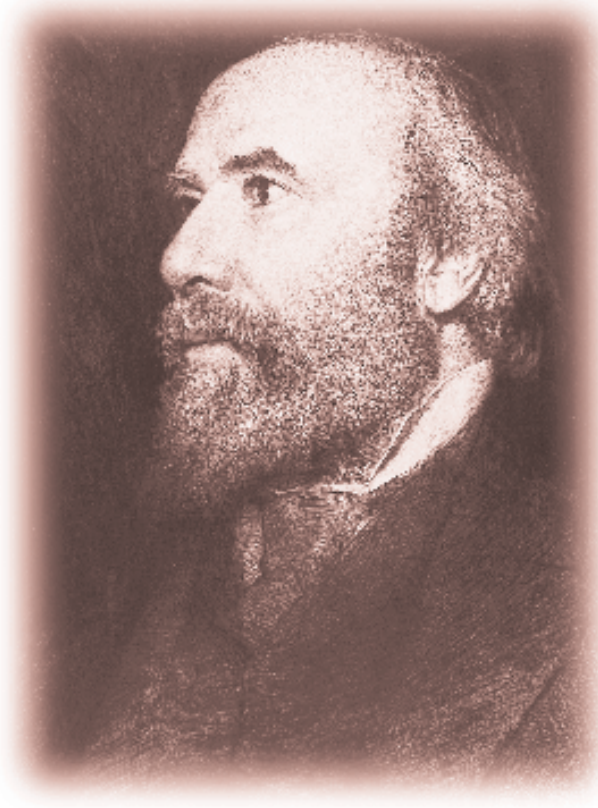
James J. Hill, in Swiss artist Adolf Muller-Ury's etching and drypoint, 1889

With the 1893 completion of his Great Northern transcontinental line, Hill once again turned to the idea of building a library. When civic leaders proposed to hold a lavish, citywide event commemorating Hill's achievement and St. Paul's status as headquarters of the rail line, the Empire Builder promptly demurred. Instead, he urged the city to dedicate its resources toward a new public library. "I will add twice as