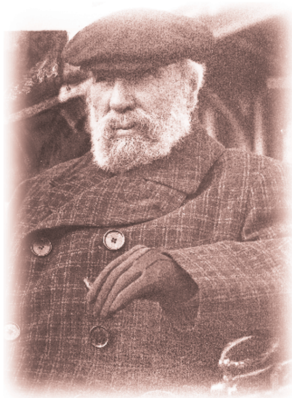
James J. Hill, about 1910

From the vantage point of what many observers have dubbed the postindustrial era, the James J. Hill Reference Library remains the Victorian entrepreneur's most visible civic legacy. Its goals and much of its character have changed during the course of the last three-quarters of a century. The Empire Builder could not have foreseen the computer revolution or many of the other cultural and technological changes that have altered St. Paul and the library that he founded. Some things he would find familiar, however. He would certainly