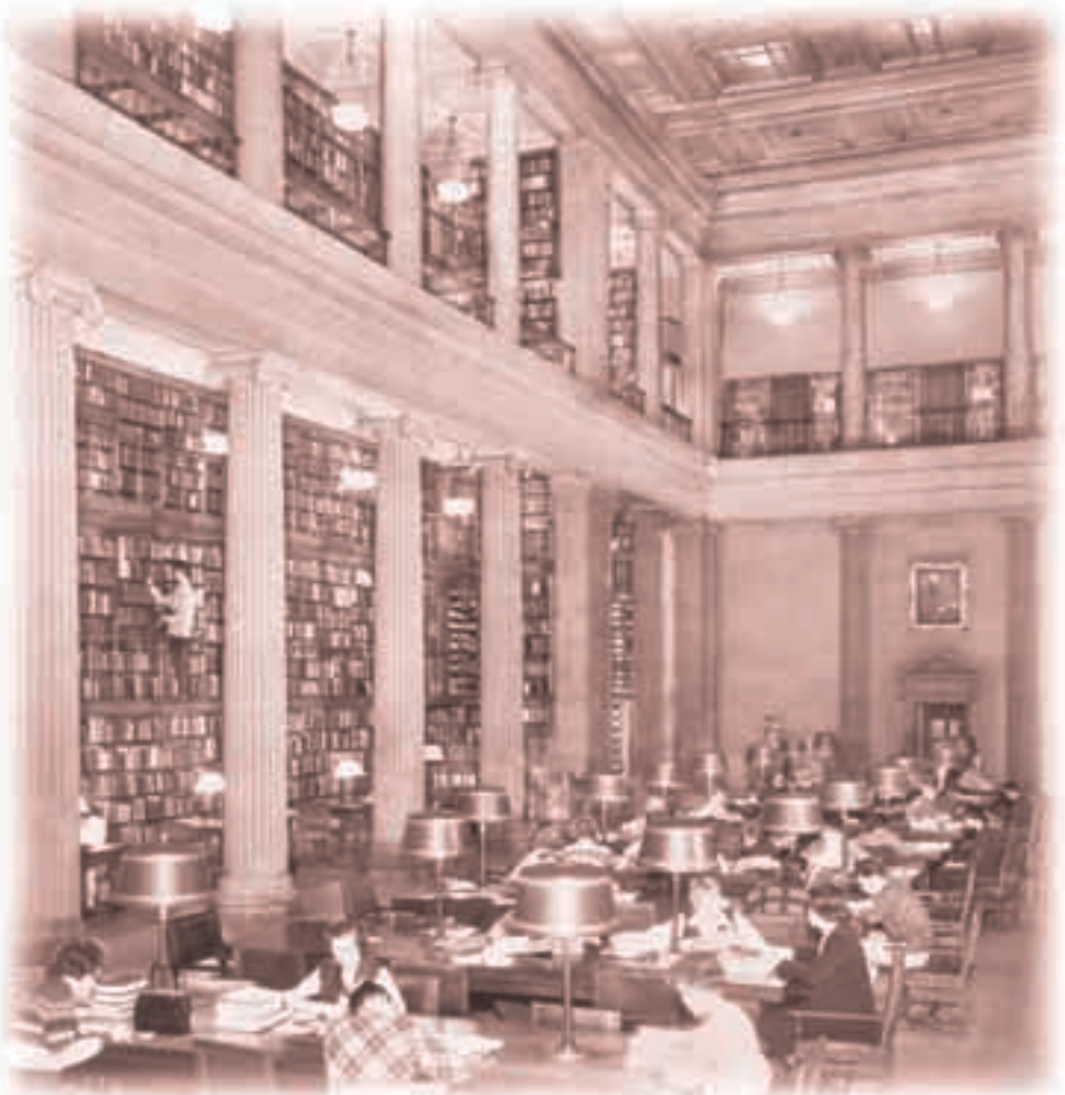
Researchers at work in the Hill library's spacious Great Reading Room