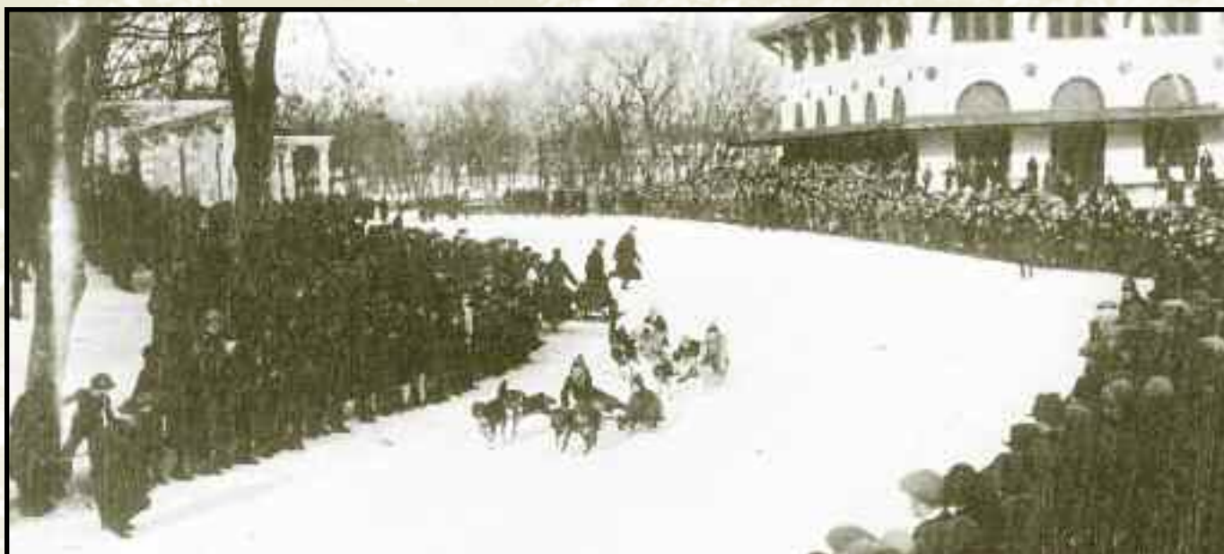
Cold-weather activities at Como Park included a Winter Carnival Dog Derby in front of the lakeside pavilion, ca. 1925.

L ANDSCAPES ARE DYNAMIC, as Como Park's development illustrates. From Cleveland's naturalistic plans of the nineteenth century to Nussbaumer's combination of the pastoral and recreational in the early twentieth century, and, finally, to the shift toward the recreational model by the 1930s, Como's appearance has changed along with perceptions of what an ideal public park should be. While the park has evolved, some of Cleveland's and many of Nussbaumer's designed