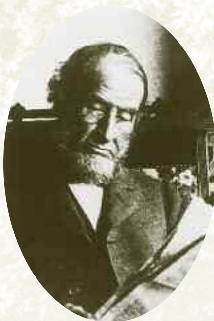
Horace W. S. Cleveland, advocate for Como Park as a naturalistic refuge from urban life

The changes in Como Park provide an important physical record of evolving ideas about the design and function of city parks. During the early twentieth century, American landscape architects and planners came to view city parks as urban spaces for organized, active recreation rather than as areas to showcase naturalistic landscaping. The designs of two landscape architects who shaped Como Park and St. Paul's park system illustrate these two viewpoints. Horace William Shaler Cleveland, who drew up plans for Como during the late 1880s, intended the park to be a naturalistic, healthy refuge from the hustle and bustle of urban life. Longtime Superintendent of Parks Frederick Nussbaumer agreed but also felt that the park should offer its visitors amenities. Particularly after the turn of the century, he made organized recreation an important component of the park. By the end of the 1920s, the recreational ideal had overtaken the picturesque across the nation and at Como Park. 1