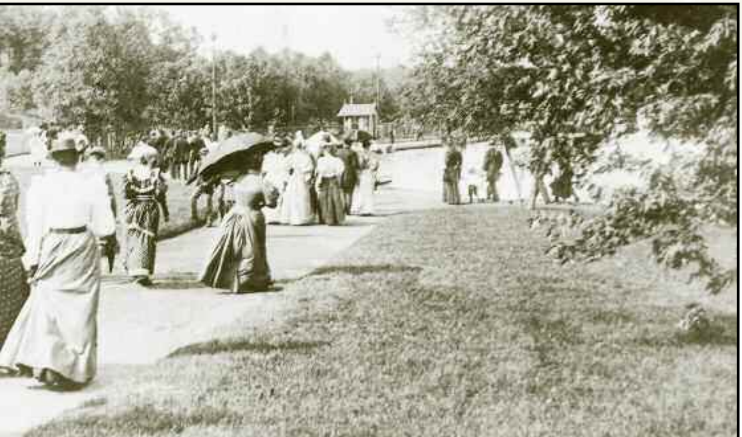
Women walking to popular Lake Como, 1895

Another new park attraction proved equally enduring. Established in 1897, the Como Park Zoo initially