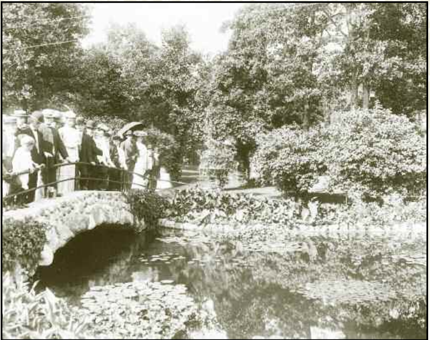
Strollers pausing on the new fieldstone-and-mortar bridge to appreciate the lily pond, ca. 1904

consisted of a large free-range pen for animals native to the region such as elk, deer, and bison. Begun in response to unsolicited donations of animals, the unplanned zoo nevertheless fit the naturalistic ideal for the park. 21