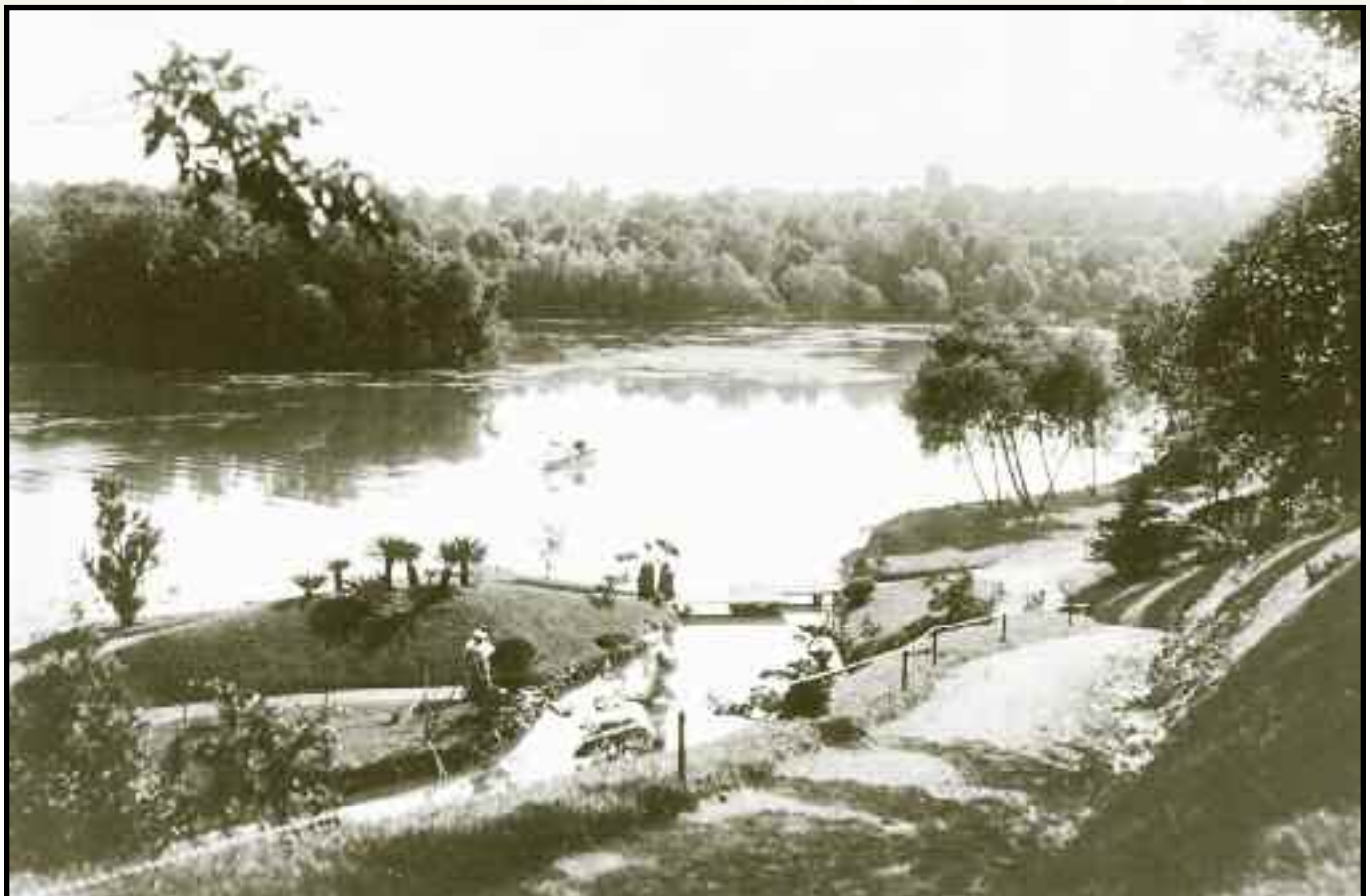
Picturesque Japanese Garden and Cozy Lake, later drained for the golf course, ca. 1905

M INNEAPOLIS AND ST. PAUL were no exceptions. While there had been little previous planning for open space, both of the Twin Cities began moving toward a system of parks during the 1880s. Although they did not yet see the congestion of the older eastern cities, leaders emulated the cultural institutions of the East at a time when parks were fashionable. And, if the