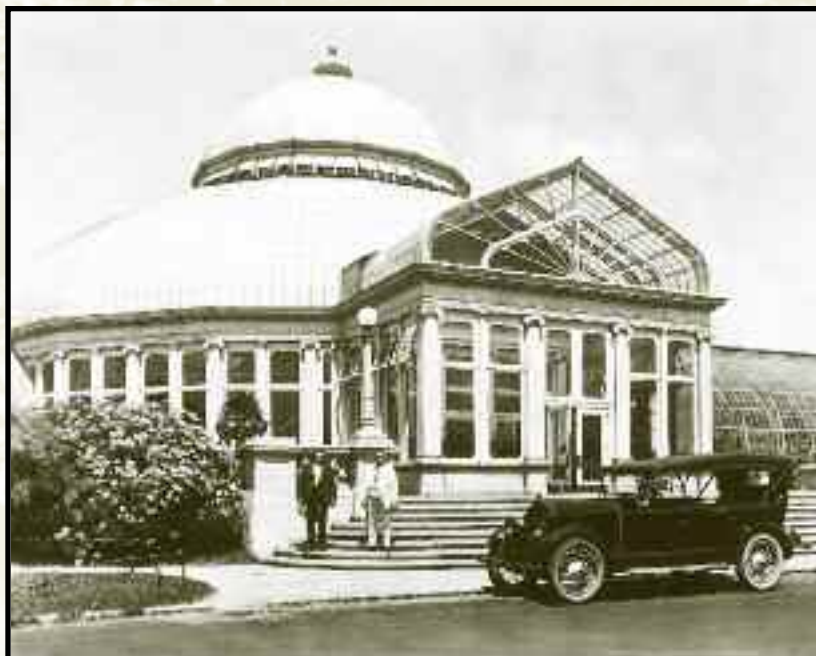
Greenhouse workers with plants raised for the park's floral displays, ca. 1920, and the Conservatory, ca. 1925 (now on the National Register of Historic Places)