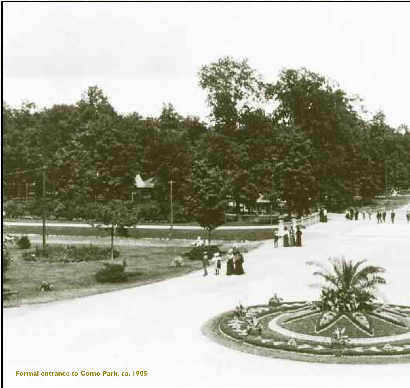
Formal entrance to Como Park, ca. 1905