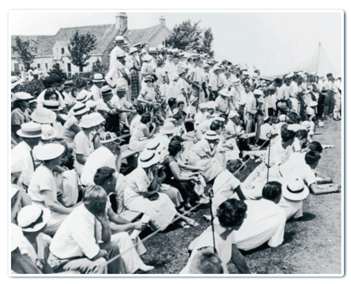
Spectators watching the St. Paul Open at Keller golf course, 1935

where the best golfers in the nation, "Negro and white, had competed for a lot more money [a $10,000 first prize] than was offered at Keller." He publicly questioned whether the PGA would baldly require its pros to withdraw from the St. Paul Open because "not even the PGA" would have the nerve to "brave the ire" of an area as big as the Twin Cities.