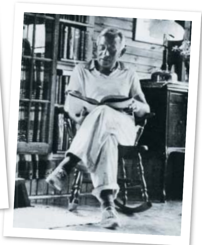
Wilderness advocate Howard Zahniser, about 1960, and (right) influential conservationist Ernest Oberholtzer, about 1942