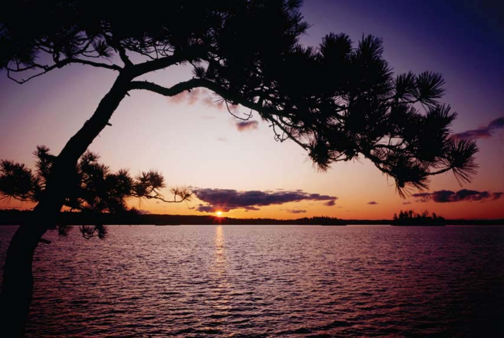
Sunset viewed from an island, Boundary Waters Canoe Area Wilderness

the BWCAW was allowed to burn without interference, but the Cavity Lake Fire (also inside the wilderness), which threatened homes and resorts at the end of the Gunflint Trail, was fought. 13