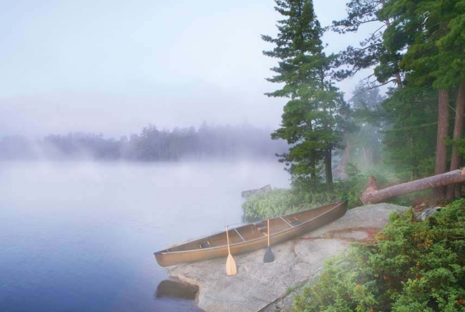
Foggy morning on Crooked Lake, Boundary Waters Canoe Area Wilderness

the precise definition Zahniser wanted for wilderness and wilderness character. A trammel is a net for catching fish, for example, or a hobble for confining horses. Untrammled, then, means unconfined, uncontrolled, unrestrained, or unmanipulated—exactly the connotations Zahniser sought. Wilderness areas would remain untrammled by humans, allowing ecological and evolutionary forces to operate without restraint, modification, or manipulation. Untrammled also matched the etymological origin of the word wilderness : literally, “self-willed land” or “place of wild beasts,” in Old English. 7