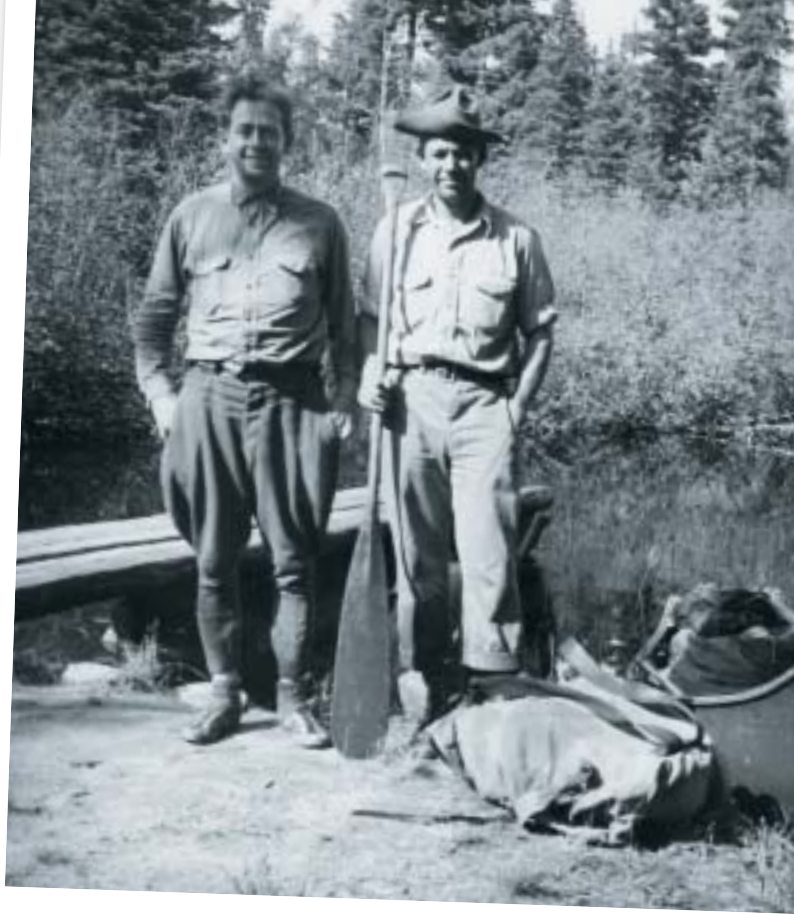
Bob Marshall (left) and Sigurd Olson on their Quetico-Superior canoe trip, August 1937

Zahniser himself acknowledged Marshall as an inspiration in "The Need for Wilderness Areas," one of his most important and frequently reprinted speeches. "Robert Marshall," Zahniser said, "whose memory I