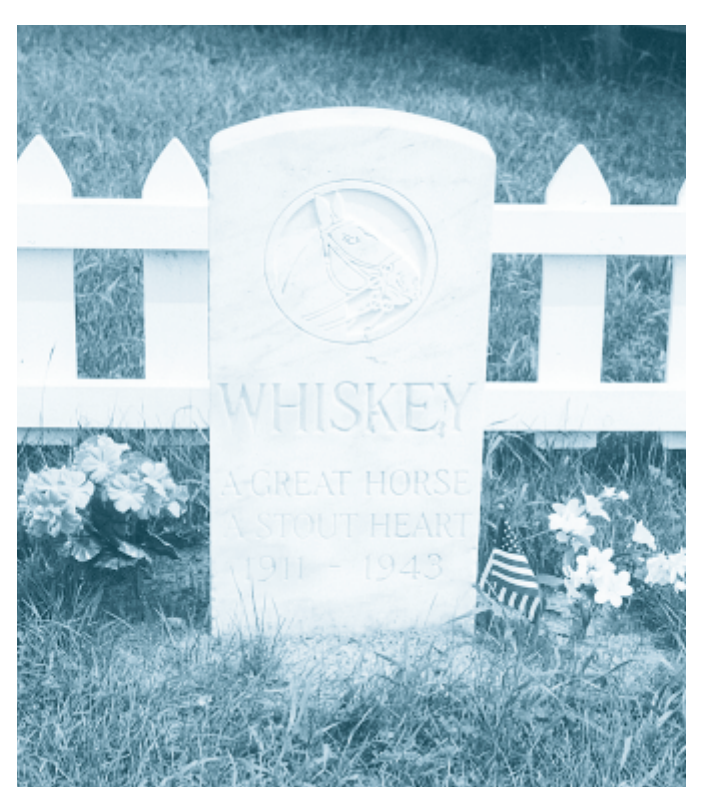
Whiskey's new grave, July 2002

WHISKEY, A LEGEND IN THE MILITARY and equine history of Minnesota, is part of the nation's history as well. During his lifetime, army officers and enlisted men from all over the United States were assigned to Fort Snelling. Thousands spent time at the garrison referred to as the "Country Club of the Army" in the 1920s and 1930s. Thousands more received military training there before and during World War II. Since every soldier at the fort was acquainted with the post's pet and mascot, the Minneapolis Star Journal 's epitaph rings true: "Any man ever stationed at Fort Snelling knew Whiskey's story."