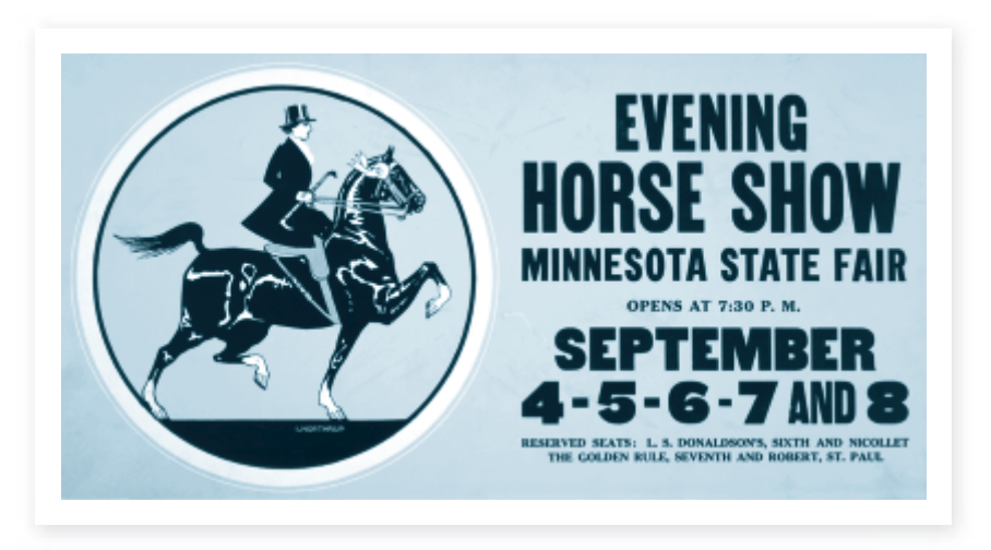
State Fair advertisement, 1922

At the show, Whiskey seemed to sense the coming change. According to one newspaper: