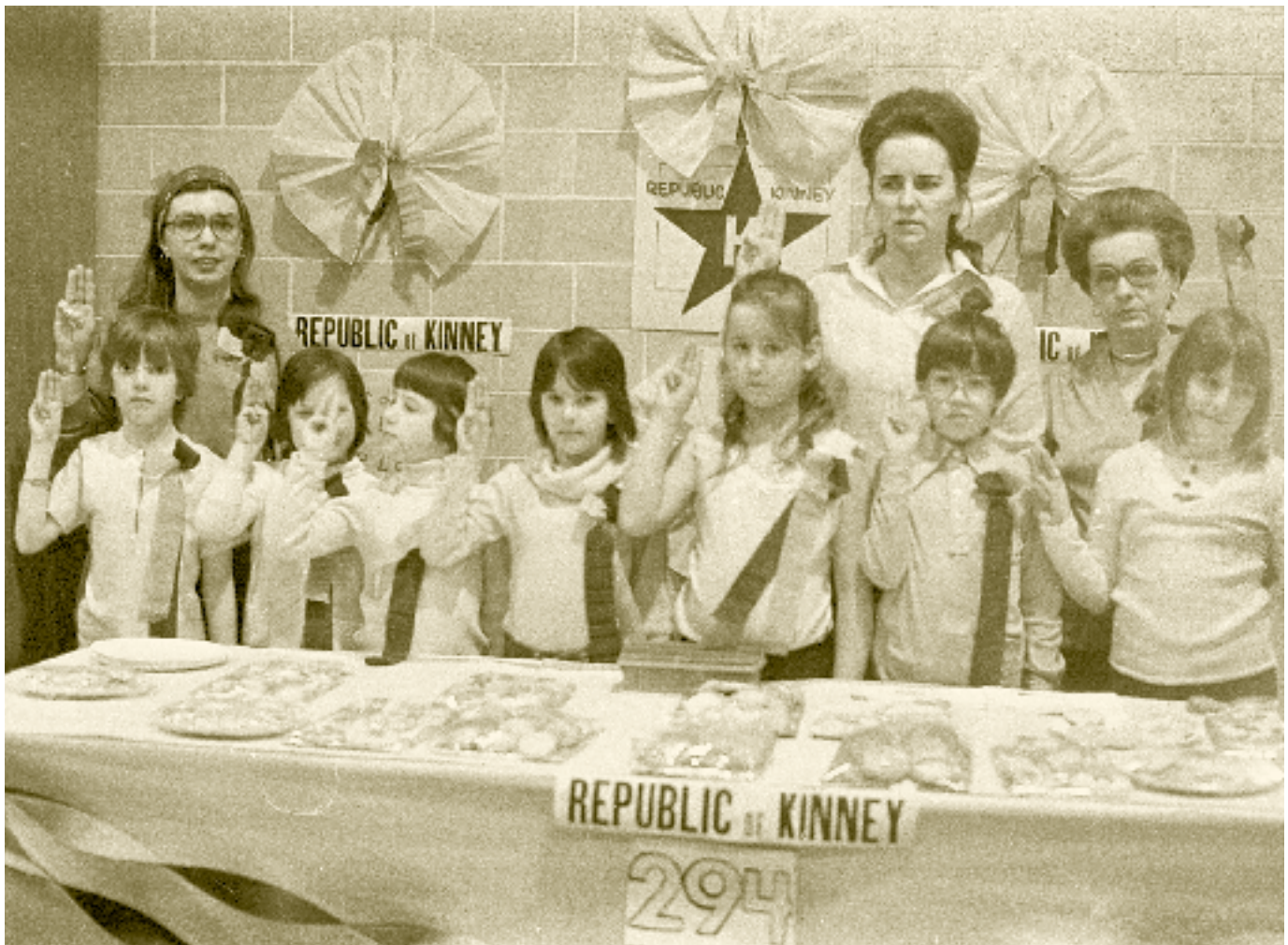
Brownie Troop 294, Chisholm, displaying Republic of Kinney foods, Girl Scout Food and Fun Fair, April 1978