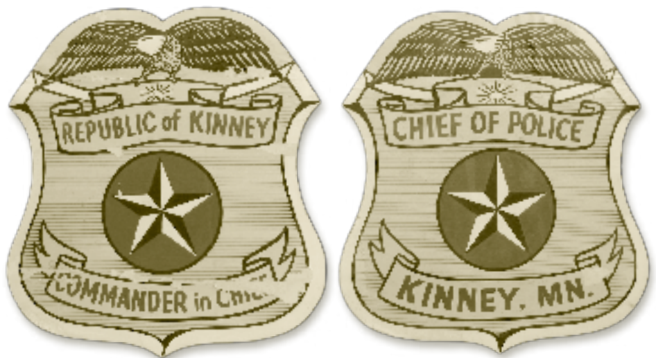
Insignia from the 1978 squad car