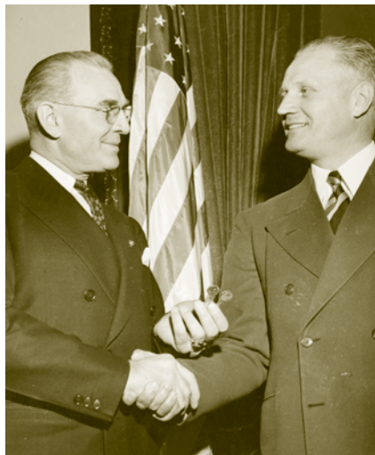
Governor Luther Youngdahl (right) with his predecessor, Edward Thye, 1947