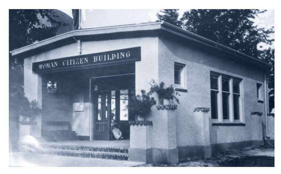
Woman Citizen Building, Minnesota State Fair, 1917

The new structure was called the Woman Citizen Building in hopes that women would use it long after the vote was won. It served as a gathering place—both an information hub, educating the public on why women should vote, and a place for all women to socialize, rest, and relax in front of a central fireplace built with a bequest from the will of Julia B. Nelson.<sup>32</sup> While the SWSA probably targeted Scandinavian Americans during the