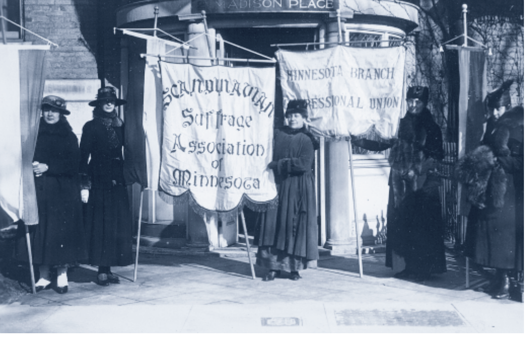
Preparing to picket the White House, Minnesota Day, 1917

A photograph of the Scandinavian section shows women dressed in traditional costumes marching along, holding the Norwegian, Swedish, and Danish flags and an Englishlanguage sign demanding the vote. Besides demonstrating the suffrag-