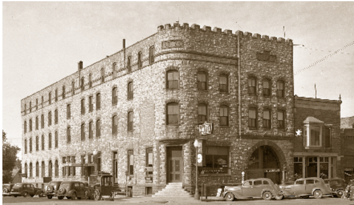
Calumet Hotel, about 1940