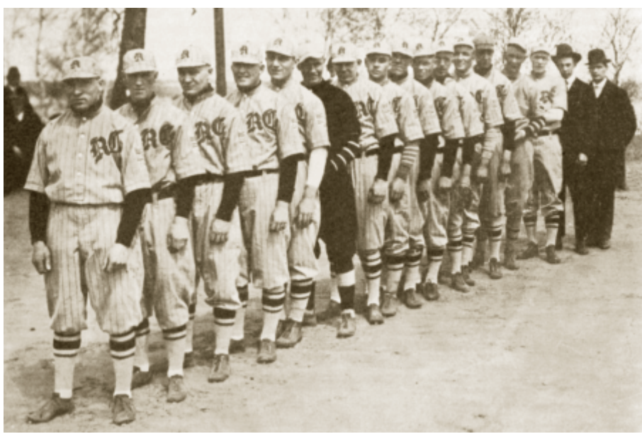
Riverside Marine Band, assembled for its daily noontime concert, October 1918, and the Cubs, Riverside shipyard's baseball team, June 1918

workers. Even Duluth's Labor World , an American Federation of Laboraffiliated weekly, carried approving stories on the "Americanization" of foreign-born workers.<sup>34</sup>