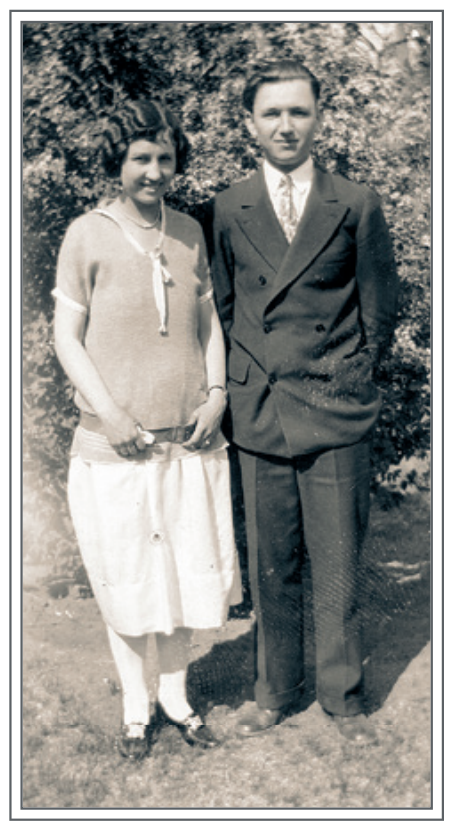
Concordia couple, 1926: a rare image.

Still, complaints by pious students about "fast-moving pleasure seekers" and "cigarette fiends" indicate rule breaking. Many alumni recalled "the fun" after curfew when they socialized in dormitories or climbed out windows for nocturnal adventures. The bright lights of Fargo lured collegians. A woman's scrapbook recalls her dates, lists nicknames, and contains tickets for the Fargo and Orpheum theaters, a card for the Blue Bird Café in the Metropole Hotel, and streetcar transfers. One insolvent student walked his date to Sunday services on winter evenings. In warmer weather, friends borrowed the motorcycle he had purchased for a summer job, loaded girls in the sidecar, and went cruising around town.38