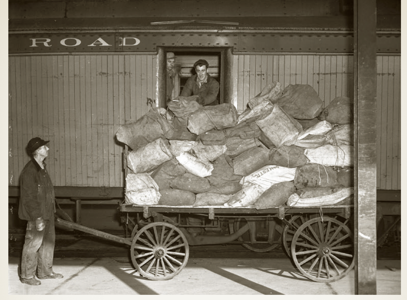
Clerks loading mail bags onto a Milwaukee Road RPO car, St. Paul Union Depot, 1949

order prefabricated homes from Sears Roebuck & Company; the building materials were shipped to them by freight car.<sup>31</sup>