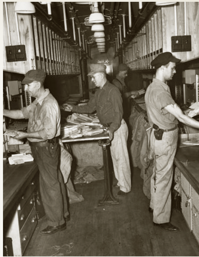
LEFT: Demonstration of how a clerk on a moving train retrieves a mail bag from a trackside mail crane, 1949. This Great Northern mail car is parked at St. Paul Union Depot. RIGHT: Four armed men, a typical crew for a branch line, working the mail; Chicago & Council Bluffs RPO on the Chicago, Burlington & Quincy Railroad, somewhere in Minnesota, 1948.

Sioux City RPO on the Chicago & North Western and the Minneapolis & Omaha RPO on the Chicago & Great Western routed mail down to the Union Pacific's and Southern Pacific's westbound RPOs in Nebraska. These took domestic mail onward to Denver and California and international mail to San Francisco for its Pacific Ocean crossing. The Minneapolis & Des Moines RPO on the Rock Island Railroad carried mail bound for southern states and Mexico as far south as Kansas City.