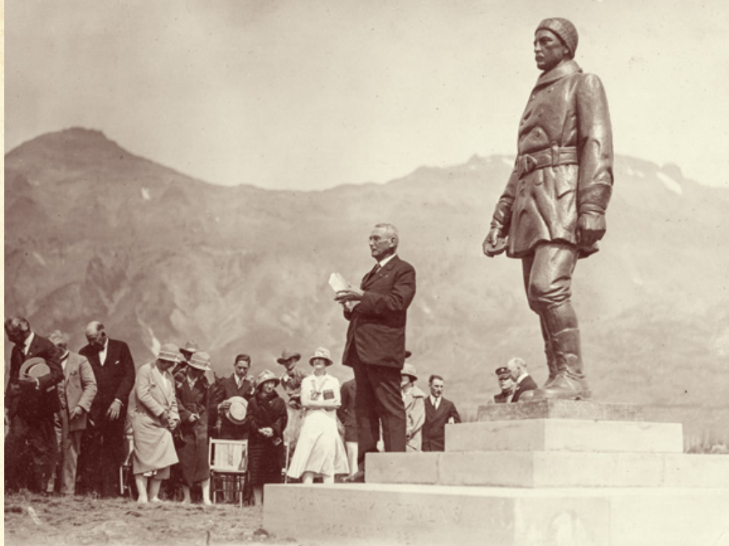
The engineer himself: John F. Stevens at the unveiling of a larger-than-life statue of himself, Marias Pass, July 1925

The Upper Missouri Expedition generated more than 1,200 favorable newspaper stories for the Great Northern. 27 Historian Agnes Laut wrote and Charles Russell illustrated a 271-page book, The Blazed Trail of the Old Frontier: Being the Log of the Upper Missouri Historical Expedition . Published in