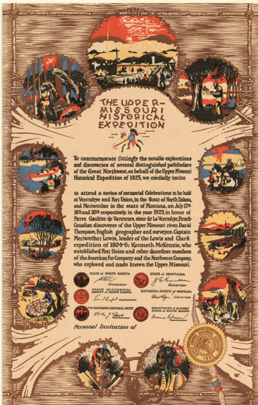
Invitation, blank and unsent, from the Great Northern Railway's copious documentary files, 1925