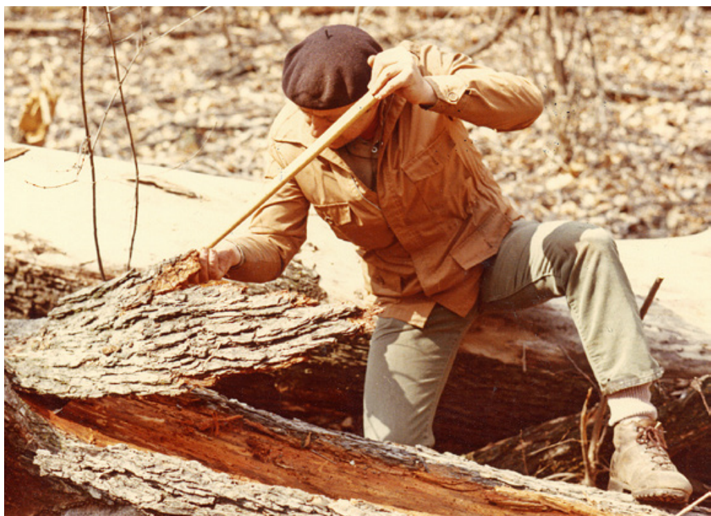
Removing infected trees and the beetles that dwelt in them was the best means of protecting healthy trees, May 1973.

In its initial stages, Dutch elm spread slowly in Minnesota. The first confirmed case occurred in St. Paul in 1961, but elms did not begin to die in large numbers until 1974. In response,