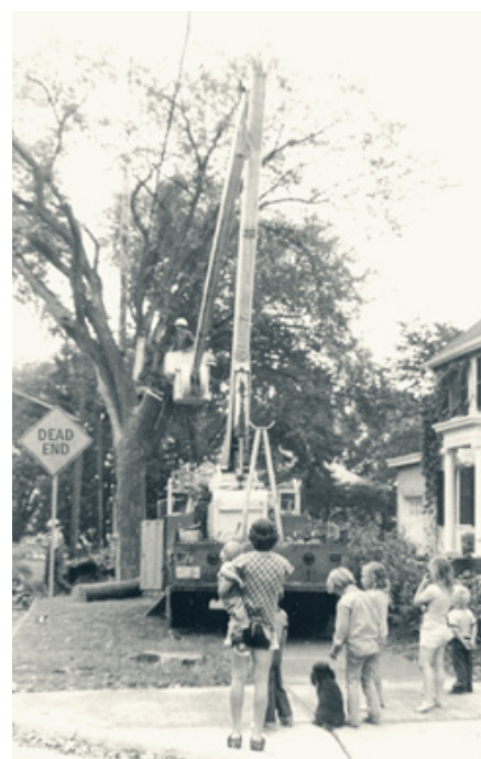
Minneapolis residents watch the removal of a diseased elm tree.