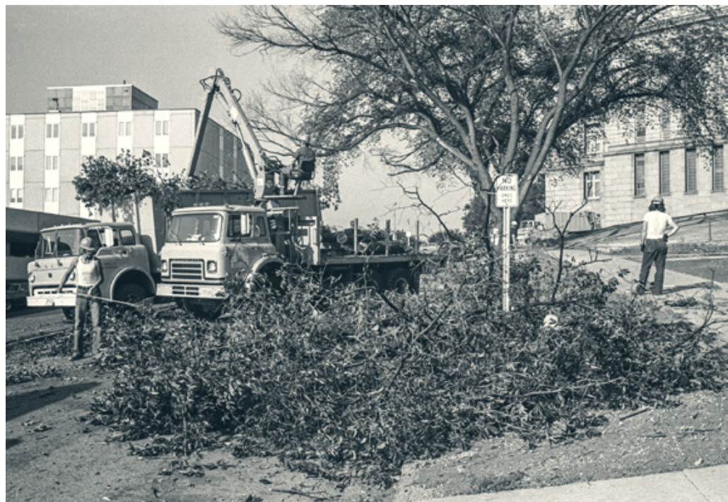
Cutting down elm trees infested with Dutch elm disease, St. Paul, July 1976.

The failure to dramatically accelerate the pace of tree removal in the face of abundant evidence that the disease had spread widely was St. Paul’s second major error. It hired private contractors to supplement the efforts of overworked city crews,