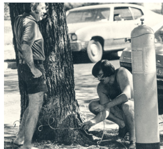
Residents of Minneapolis's East Calhoun neighborhood raised funds to inject their elms with an expensive chemical, Lignasan, in an attempt to stave off Dutch elm disease.

In April, block captains began knocking on doors to collect