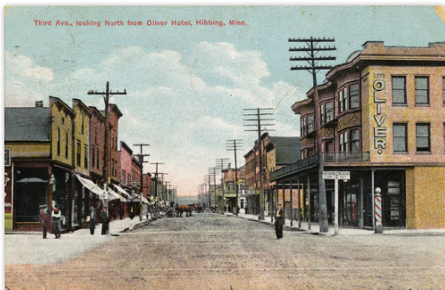
Third Avenue, Hibbing, looking north from Oliver Hotel, around 1910.