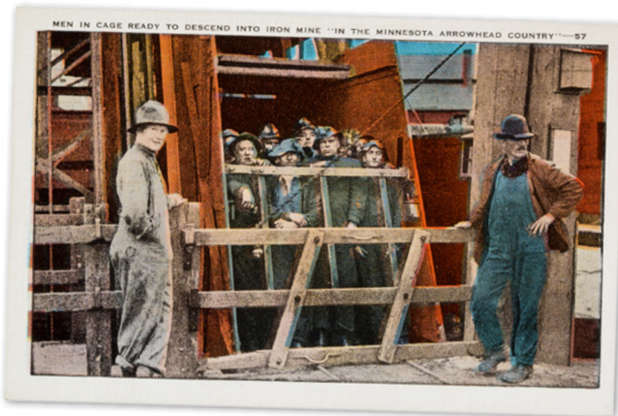
Miners ready to descend into an iron mine.

their demands were justified: with World War I into its third year in Europe, iron ore was a precious commodity, essential for the production of the steel required for munitions, tanks, and other war supplies. U.S. Steel Corporation, and in particular its subsidiary, Oliver Mining Company, were making incredible profits. Earnings in the first six months of