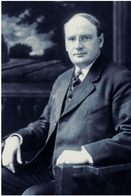
Governor Joseph A.A. Burnquist.

... is not practiced by the laboring men who are asking for a few cents increase in their pay—it is openly, wantonly and viciously practiced by the United States Steel Corporation and its hirelings which extend into every branch of the government,” they wrote on August 19. In another article on the same day, they proclaimed that “No great cause ever gained footing in this country or any other without revolt, and we sincerely hope that the people in this state are reaching in that direction—there is surely cause enough for revolt.” In near biblical prose—seemingly another indication of how their attitudes toward the IWW had clearly shifted as a result of the strike—they wrote, “It may be in time that the present activities of the Industrial Workers of the World will be looked upon as the spirit that brought forth the men that will lead us up out of the wilderness.” 28