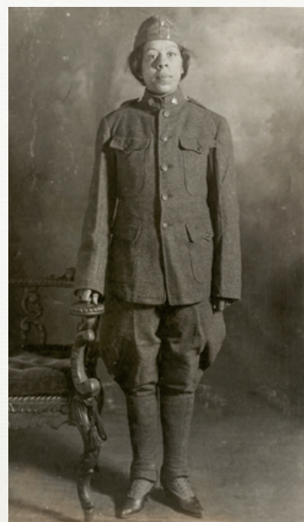
Unidentified African American woman wearing a military uniform, ca. 1918. Based on the collar insignia and provenance of the photograph, this is likely a Minnesota Home Guard uniform.

The battalion resumed activity when it marched in the Thanksgiving Day parade, which drew a vast crowd deemed the "grandest ever in St. Paul." The companies continued to hold military balls, but enthusiasm for the