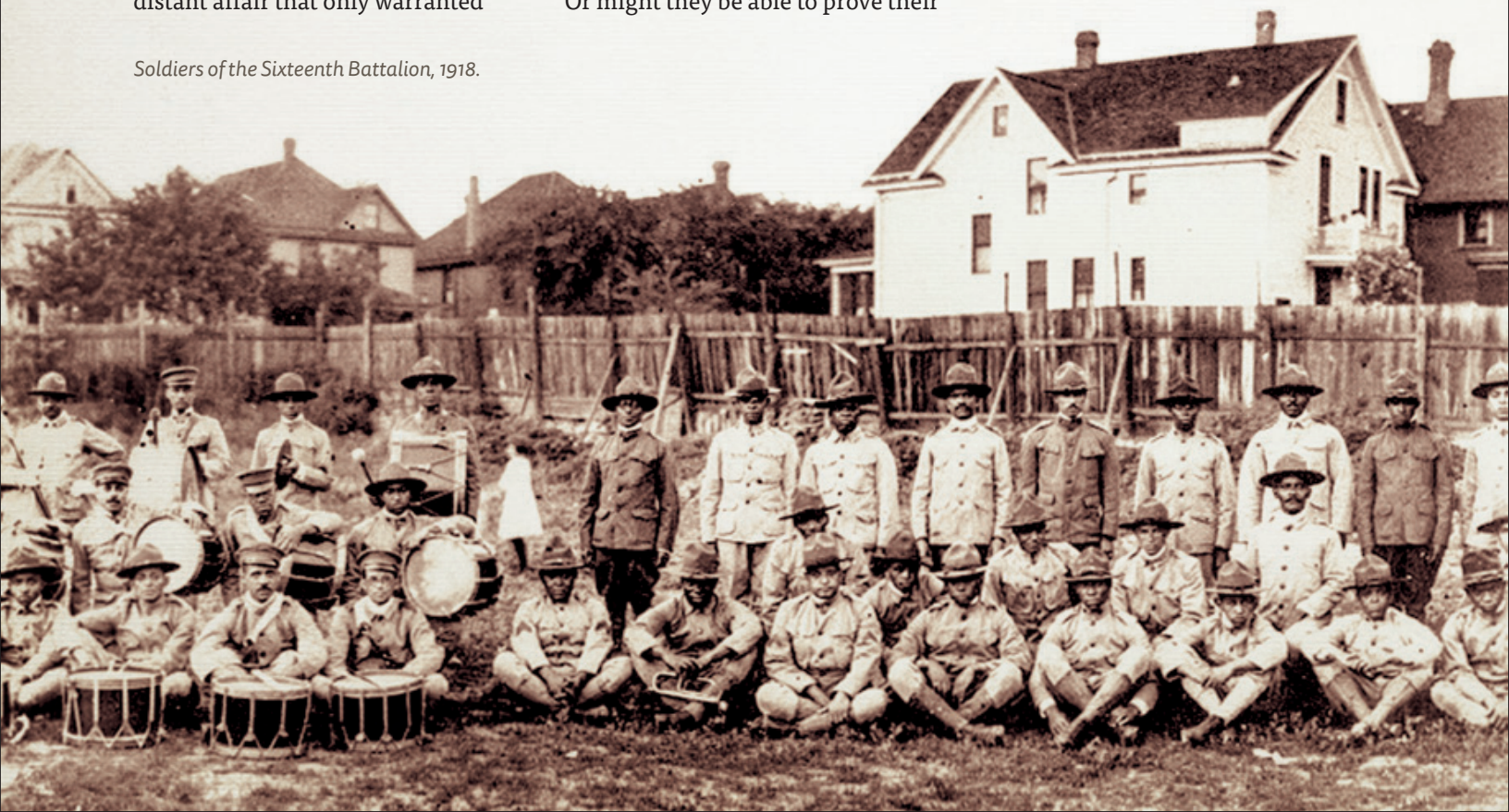
Soldiers of the Sixteenth Battalion, 1918.

A unique wartime organization that illuminates the experiences of some African American Minnesotans during World War I is the Sixteenth Battalion of the Minnesota Home Guard. The Sixteenth was the only Home Guard unit that recruited African Americans and marked the first time the state military allowed the recruitment of black people. Black soldiers were citizens but their rights were denied every day. An African American in uniform was a potent