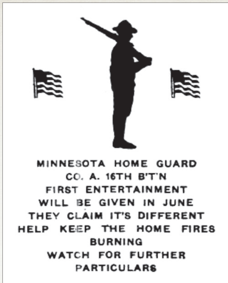
Ad for an event hosted by Company A of the Sixteenth Battalion, Minnesota Home Guard. Image is from the Appeal, May 25, 1918.

The demographics of those who served in the battalion represented a sampling of the Twin Cities black population during World War I. By birthplace, the men of the battalion were almost evenly split between North and South. The vast majority of St. Paul volunteers lived in the Rondo neighborhood; a smaller group lived near Oakland Cemetery. In Minneap-