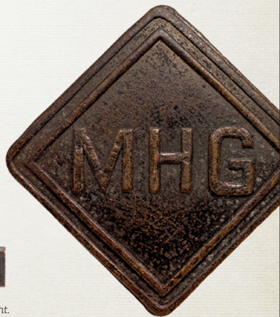
Minnesota Home Guard service insignia pins, ca. 1917. Officer insignia, left, enlisted man insignia, right.