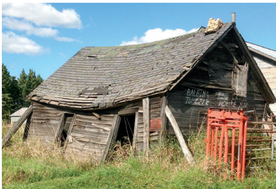
Temporary shelter, Moose Lake, October 2015.

simultaneously.” Influenza also spread among the relief workers. 29