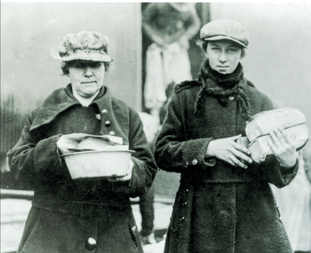
Forest fire refugees receiving rations.