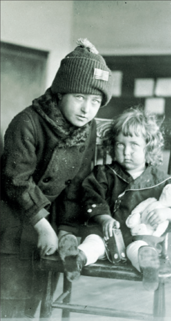
Refugee and relief worker, Moose Lake fire.

skeptical of the value of the social worker, made the statement last week that of all the groups that have gone up to help in the fire relief there was one group whose morale had steadily increased with the difficulty of the work and who were now doing the big job on the field, namely the social workers." 30