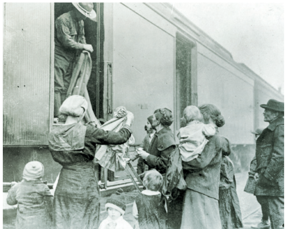
National Guard giving out clothing to refugees after the fire at Moose Lake.

Although they were neighbors, Duluth and Superior were organized under different regional Red Cross headquarters. The Superior, Wisconsin, chapter of the Red Cross