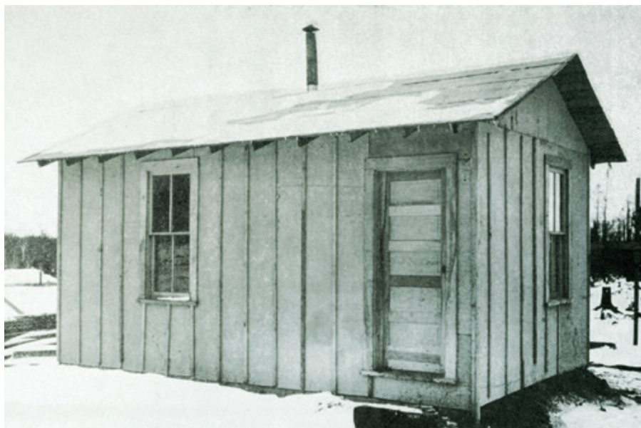
Temporary standardized shelter authorized by the Forest Fires Relief Commission early in the emergency.

F ranks Bruno observed in the Northern Division’s November 1918 report, “The work in the north woods is peculiarly trying. Large areas were destroyed, roads became impassable; and the influenza settled down on the refugees very soon after the work of relief began.” The absence of a “considerable number of doctors” due to service with the US Army in World War I and the growing influenza epidemic taxing the remaining doctors in the area also created challenges for meeting the medical needs of fire survivors. The Superior Red Cross chapter reported, “Superior nurses and doctors gave all their time, strength and ability, but found it impossible to care for all the [influenza] cases which seemed to develop