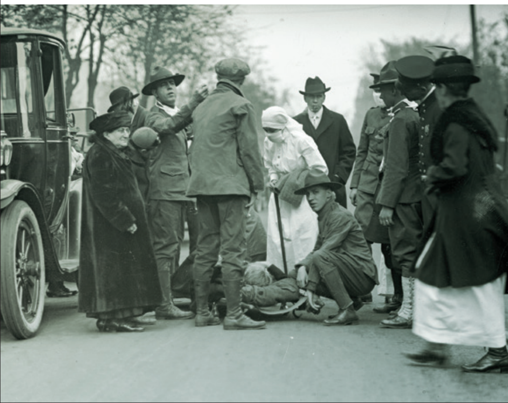
Red Cross and National Guard with forest fire victims, Carlton County.