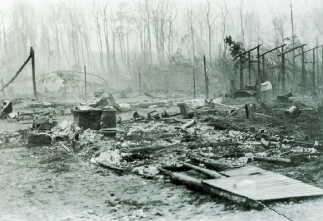
Ruins of a residence after forest fire, Duluth.

chapter “took the lead and twenty-four hours before anyone could reach Duluth, that chapter had its relief plan matured and working within two or three hours of the beginning of the conflagration.” Many burn victims were treated at the Duluth Armory, with the serious cases being taken by the Motor Corps to local hospitals. Fire refugees were immediately housed in schools, churches, stores, hotels, private residences, and public buildings. National Guard and Home Guard units would stay in the fire-stricken areas for many months to clear roads, patrol towns, and assist with both the cleanup and the rebuilding process. 5