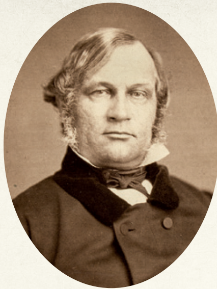
Alexander Ramsey, ca. 1860.