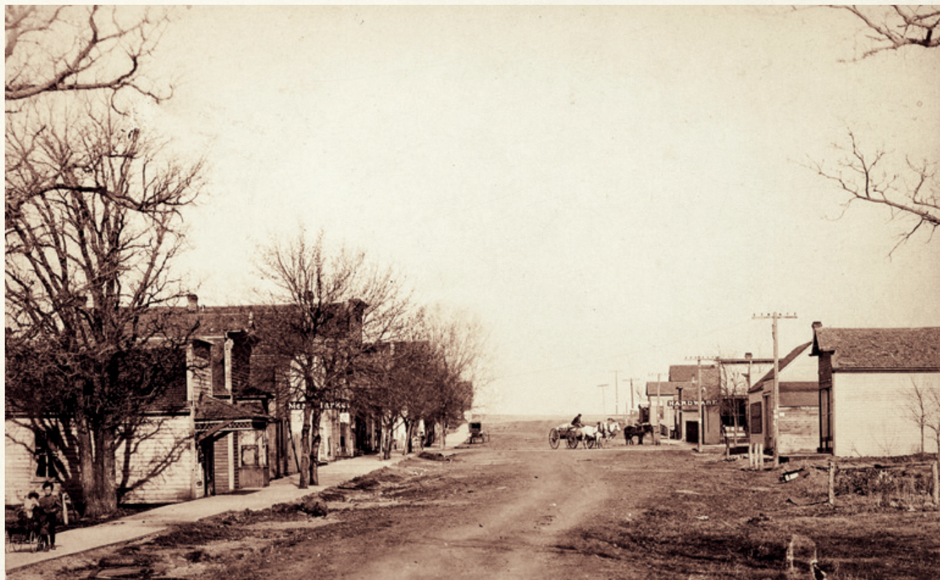
Main Street, Clitherall, Otter Tail County, ca. 1910.