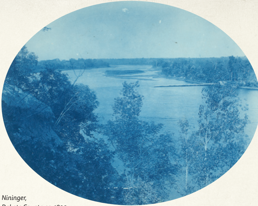
Nininger, Dakota County, ca. 1890.