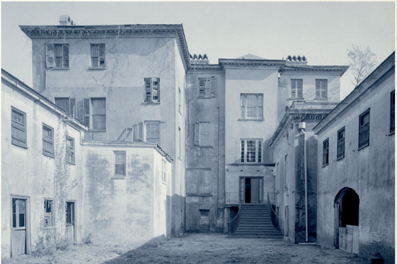
Rear side of Aiken House, with outbuildings: service building and stable on right and slave building and kitchens on left, 1963 view.