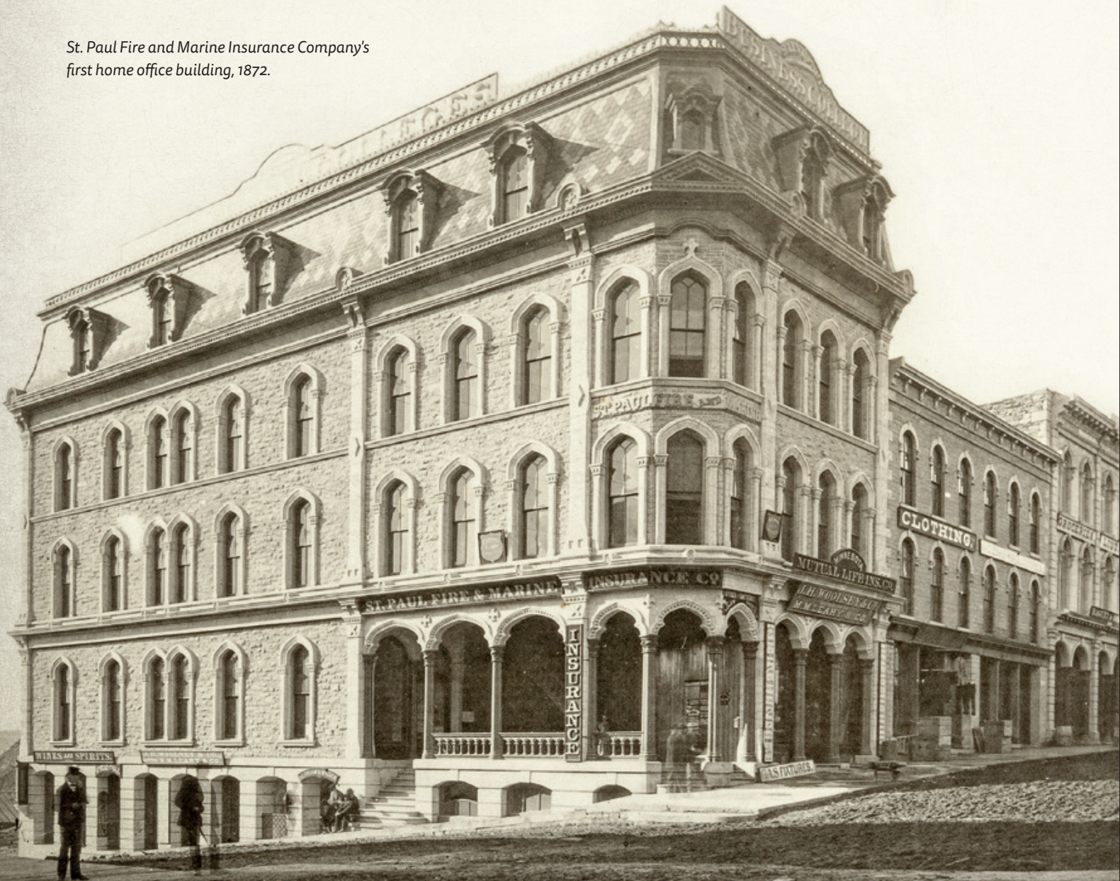
St. Paul Fire and Marine Insurance Company's first home office building, 1872.

in the New Orleans Crescent newspaper in which he asked his fellow Southerners to invest in Minnesota. He touted the territory's growth, and predicted even more growth after Southerners came to St. Paul "either as a source of investment for the future, or as the great 'Summer Home' of health and recreation." He wrote that Minnesota's status as a territory contributed to its growth: "I suggest the propriety and public policy of our remaining a Territory for a few years, without manifesting too much eagerness to assume the mantle of State sovereignty. Our progress is rapid, but healthy and permanent,