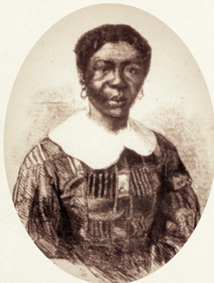
Dred and Harriet Scott