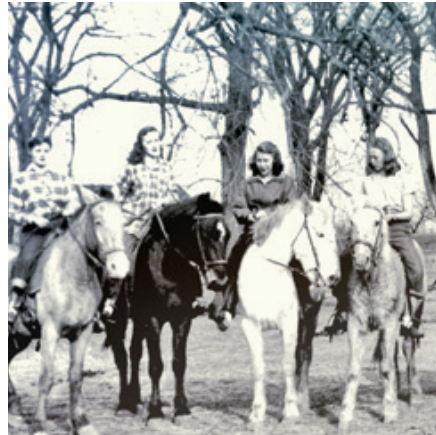
WAA members enjoying an early morning ride.