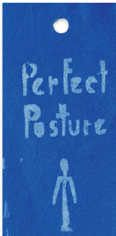
The WAA organized what the student paper called the “posture police” in 1924. Ribbons were awarded to male and female students.

national organization for a number of years. That independence gave student members unusual authority over their creation. They drafted a constitution, negotiated with the Athletic Union, named 50 charter members—nearly a quarter of all female students—in the spring of 1921, and designed awards and honors for athleticism. Although Ole women had their own extracurricular female literary and honor societies and could partake in a mixed-gender Luther league and choirs, the WAA was the first, and for a long time the only, female space that was purely recreational in nature. Consequently, many Ole women got involved, paying dues, competing in class-against-class tournaments, and tracking their points toward tangible “emblems of athletic success.” 10