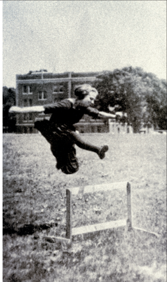
Athletics was a key way St. Olaf women students staked a claim to campus life.

Athletic life was different for women, who did not have much access to the gymnasium in the basement of Ytterboe Hall. They gained no regular physical education program until 1916, more than a decade after men did. They were, however, assessed the same annual Athletic Union fee as men, in effect helping to pay for men's uniforms and competitions. The construction in 1912 of Old Mohn Hall, the first real dormitory for women, gave female students a makeshift gym space in its basement.