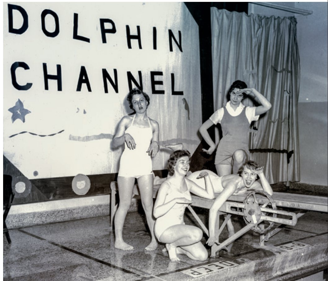
The Dolphins were a popular offshoot of the WAA.

Even when the St. Olaf yearbook editor was female, captions under photographs of gym-suited women with flexed bows or tennis rackets joked that “co-eds” needed to “hold a beau” or “court him.” In such an environment, the WRA had to pro-