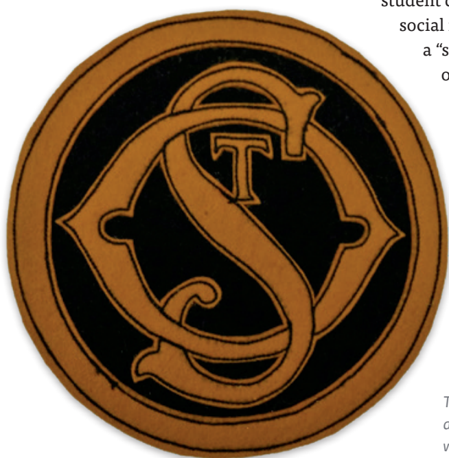
The WAA fought for a year to be able to award letters to senior women who earned them.

In 1927, the women in St. Olaf’s WAA branch finally joined the national Women’s Athletic Association, yet another sign that administrators had started to concede ground to national collegiate trends. Suddenly Ole women had access to a circuit of other Minnesota WAA branches that, together, met for an annual “play day”—the national WAA’s signature event. As the practical expression of the organization’s philosophy, play day brought together