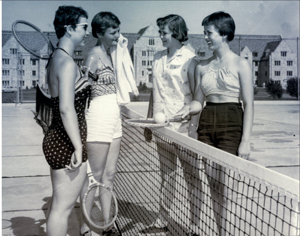
In the postwar era, the WAA promoted itself as a way "to absorb the sun, lose some pounds, and maybe make some new acquaintances."

Fewer and fewer Ole women paid WRA dues, signed up for its competitions, or tracked their athletic points. Other organizations—like the Dolphins and the very popular mixed-gender skating and ski clubs