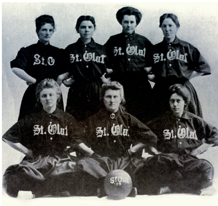
The victors in a 1909 inter-class basketball tournament, the class of 1913.