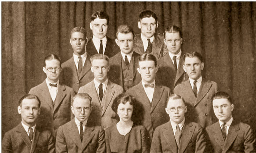
Wilkins was the first black reporter and night editor of the Minnesota Daily ; 1923 Gopher yearbook photo.

by raising $575 from a dance. He also served as chair of the Urban League as well as of the Hallie Q. Brown Community Center. Wilkins graduated from the University of Minnesota in 1923 with a bachelor's degree in sociology and a minor in economics. 6