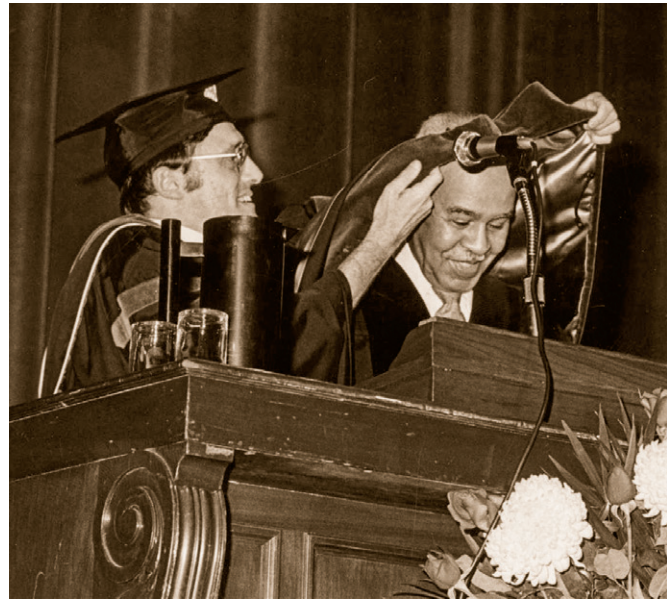
University of Minnesota president C. Peter Magrath bestowing Wilkins with an honorary doctor of laws degree, 1976.

the Wilkins Townhomes are a 23-unit rental development for low- and moderate-income families in St. Paul's Summit-University neighborhood. They are located on three sites: 587-613 Ashland Avenue, 608-618 Holly Avenue, and 795-799 Marshall Avenue. 11