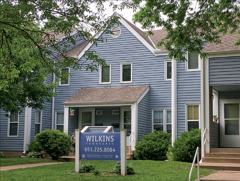
One of the three Wilkins Townhomes, this one on Ashland Avenue in St. Paul.

Selby businesses, however, submitted a counter-petition objecting to the renaming. 13