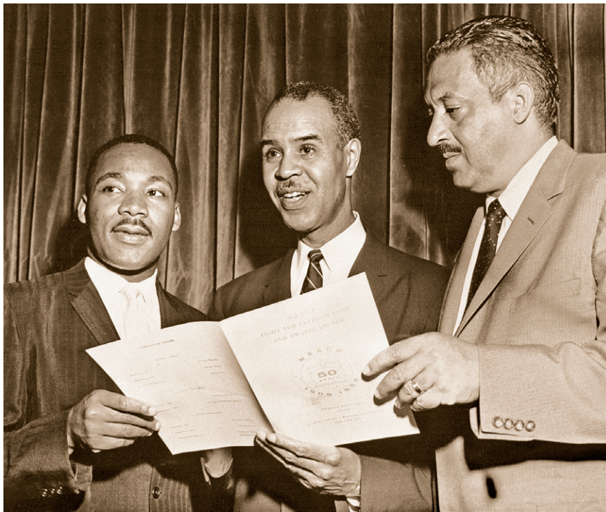
Martin Luther King Jr., Roy Wilkins, lawyer and later US Supreme Court associate justice Thurgood Marshall, at an event marking the fiftieth anniversary of the 1909 founding of the NAACP.