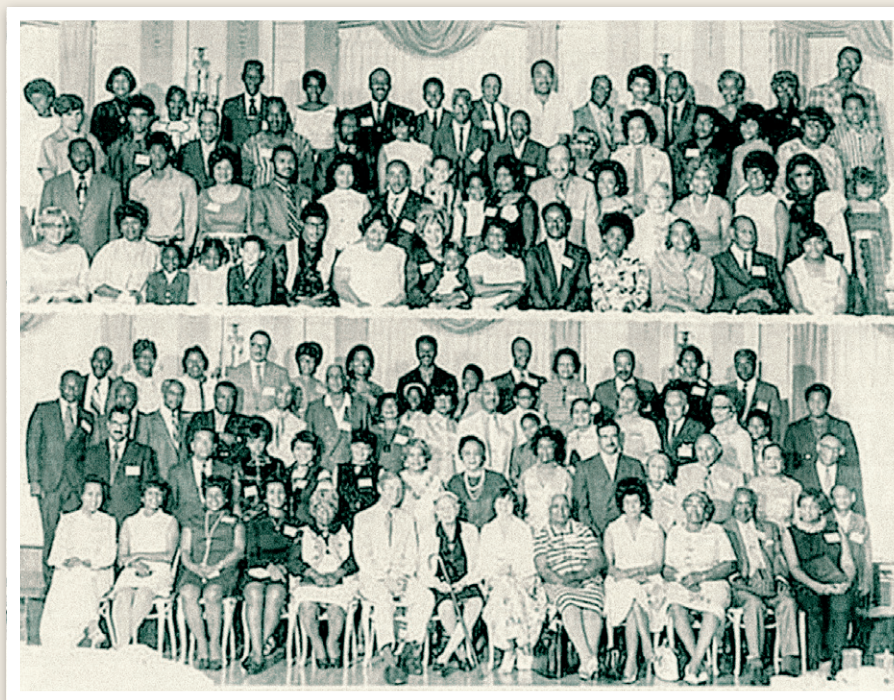
African American "family reunion" in Duluth, 1970.

To be sure, some black and white residents did at least begin to reckon with the gratuitous violence that had helped to establish and preserve Duluth's racial order. On October 10, 2003, thousands gathered downtown, this time not with murderous intent,