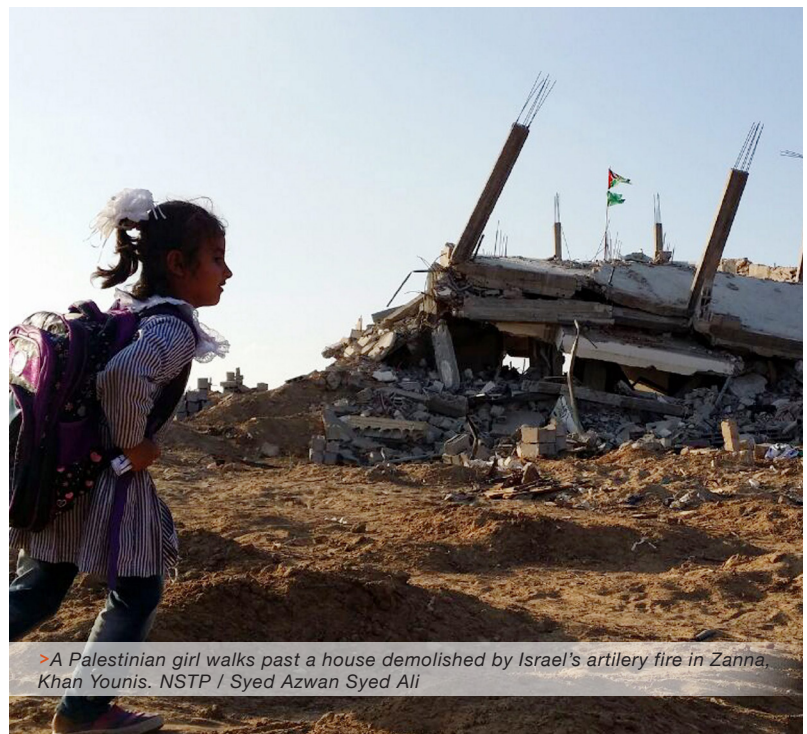
> A Palestinian girl walks past a house demolished by Israel's artillery fire in Zanna, Khan Younis.