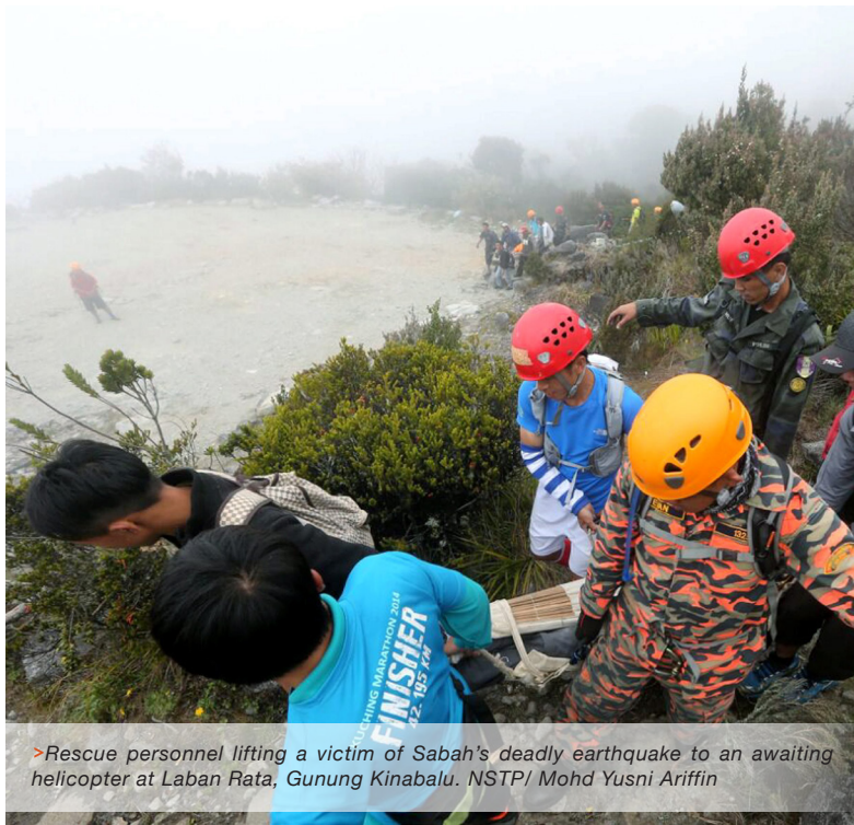
> Rescue personnel lifting a victim of Sabah's deadly earthquake to an awaiting helicopter at Laban Rata, Gunung Kinabalu.