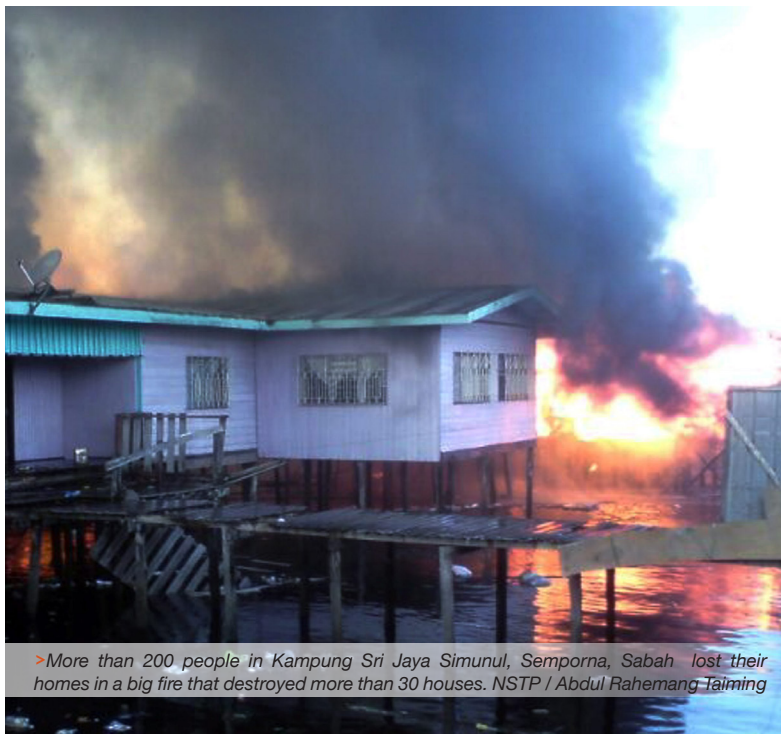
> More than 200 people in Kampung Sri Jaya Simunul, Semporna, Sabah lost their homes in a big fire that destroyed more than 30 houses.