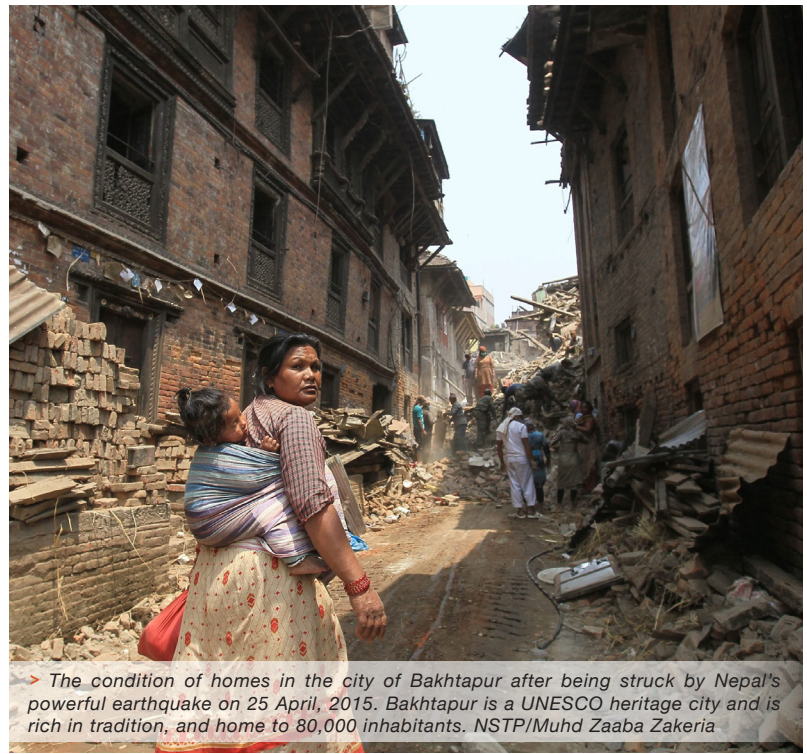
> The condition of homes in the city of Bakhtapur after being struck by Nepal's powerful earthquake on 25 April, 2015. Bakhtapur is a UNESCO heritage city and is rich in tradition, and home to 80,000 inhabitants.