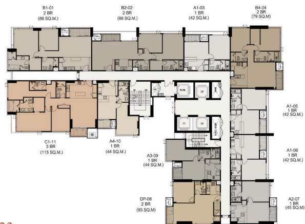
Floor 12A, 15, 17, 19, 21, 23