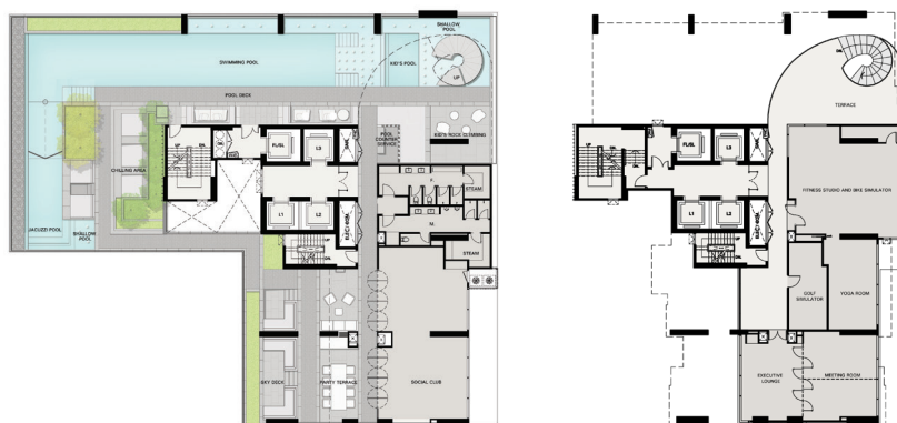
Facilities Floor 29, 30