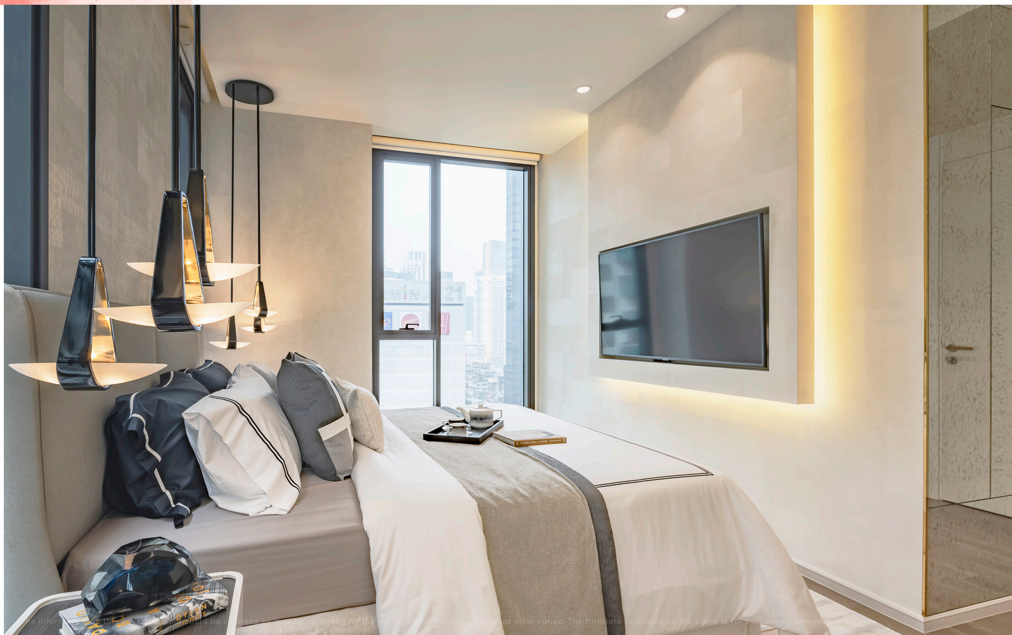
STANDARD TWO BEDROOM