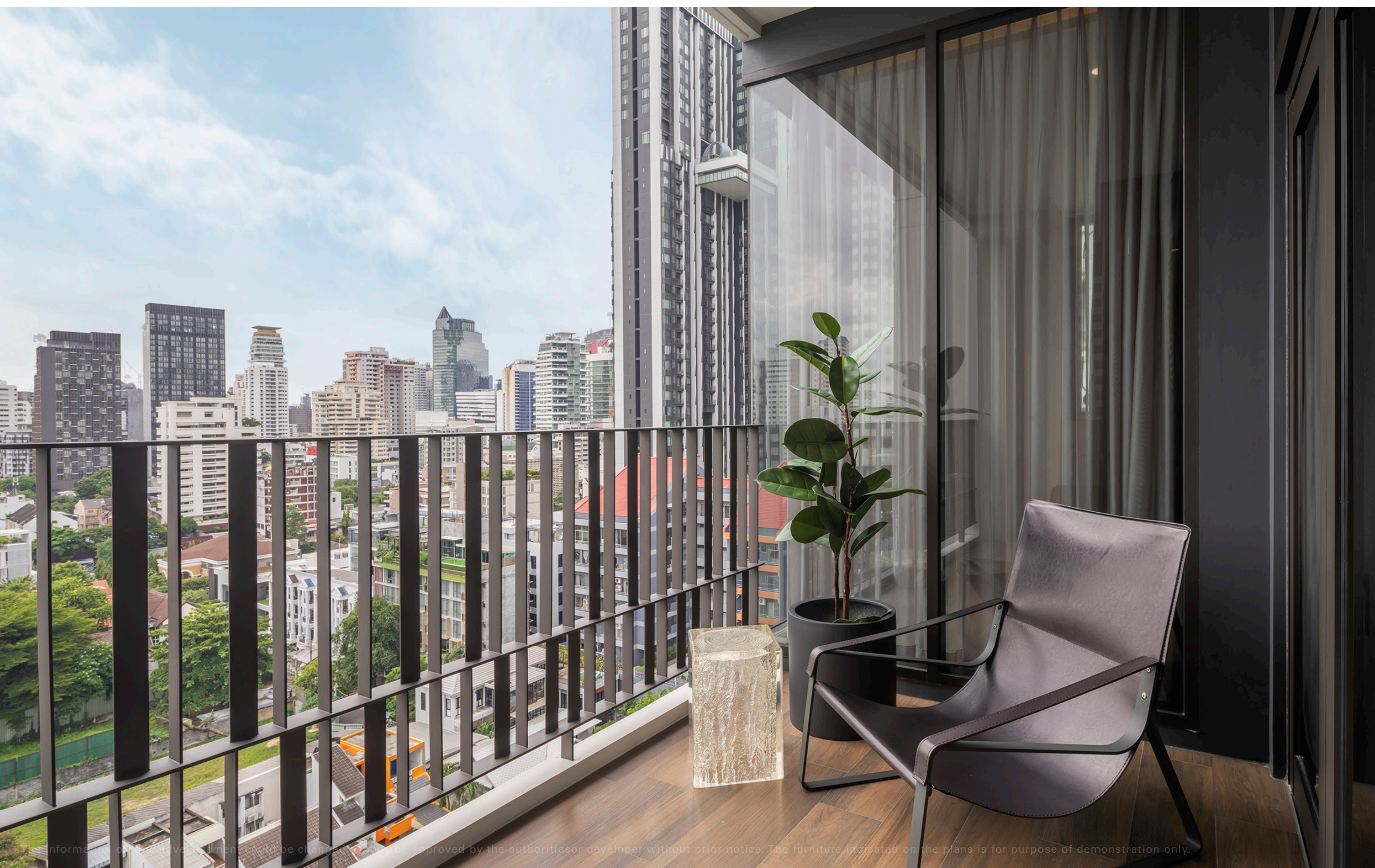
STANDARD TWO BEDROOM