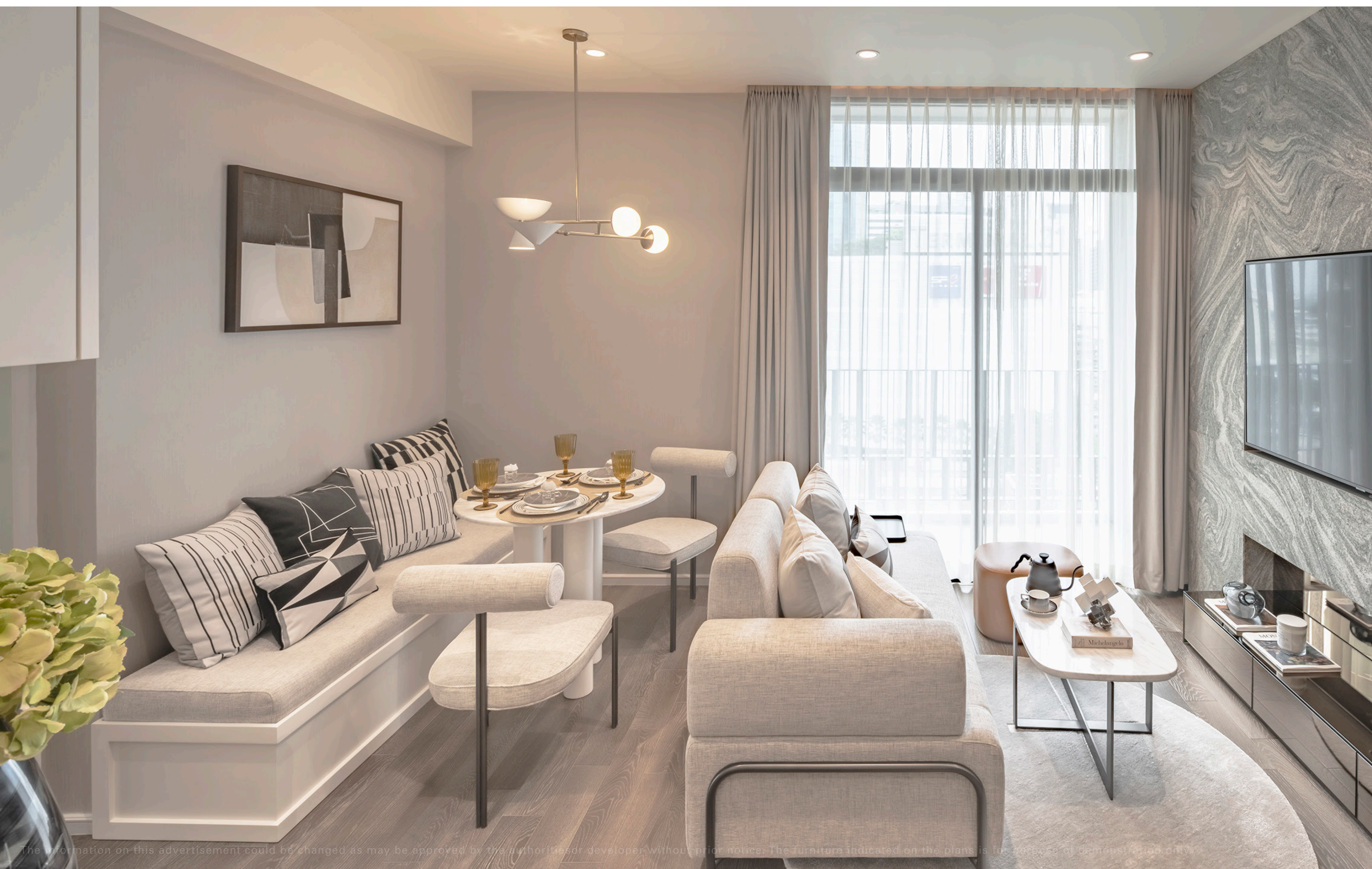
STANDARD TWO BEDROOM