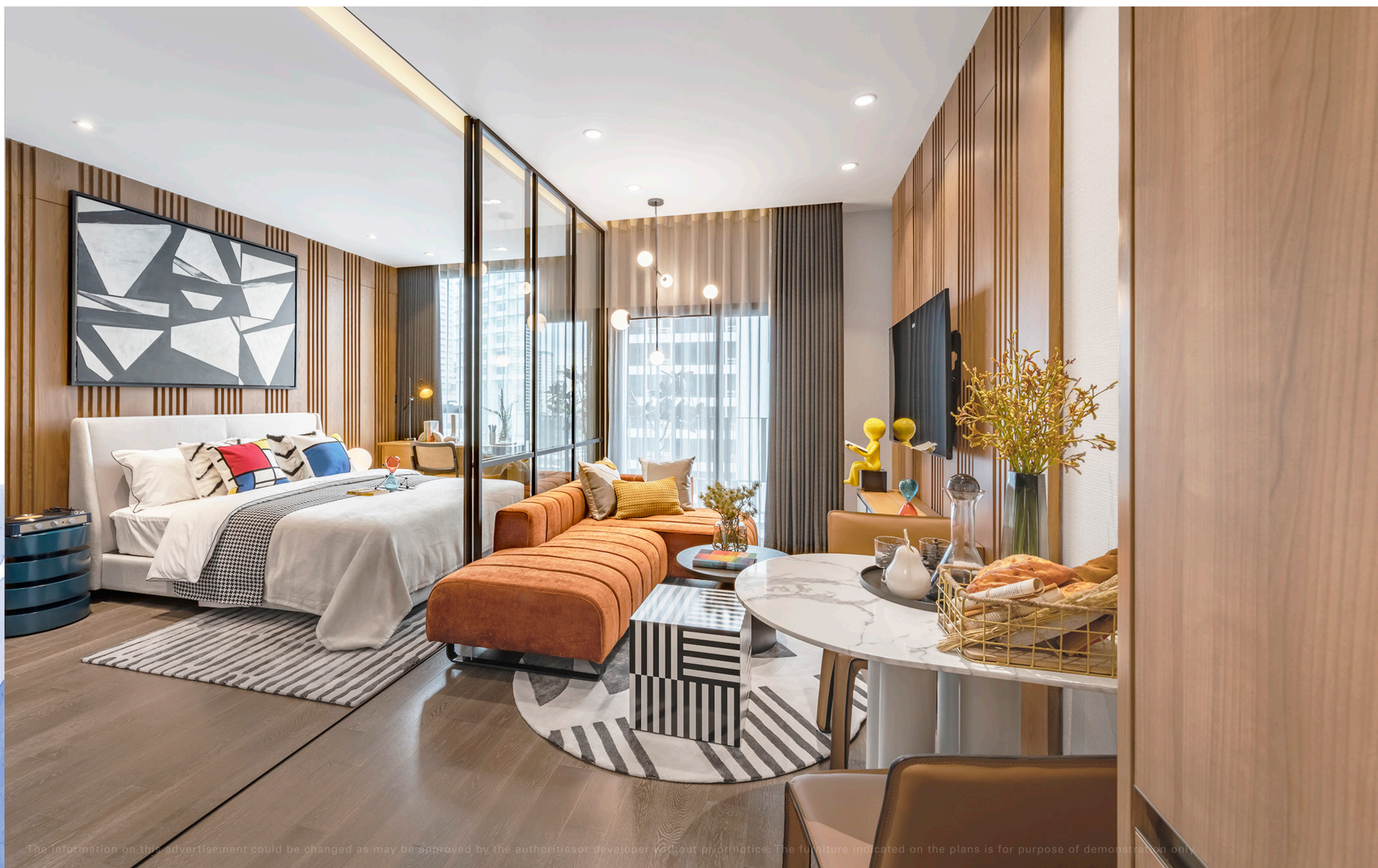
STANDARD ONE BEDROOM