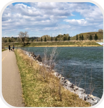
BOW RIVER PATHWAY