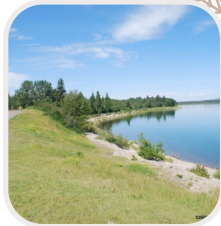
SOUTH GLENMORE PARK LOOP