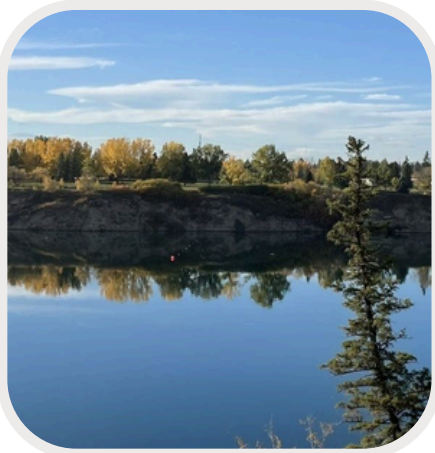
GLENMORE RESERVOIR LOOP