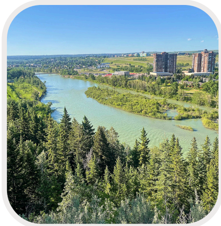
DOUGLAS FIR TRAIL