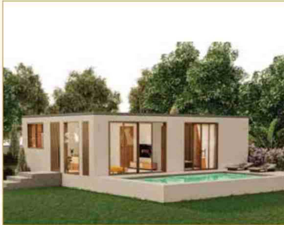
900 sq. ft Villa - 2 BHK