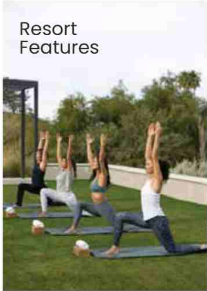
Global Wellness Center