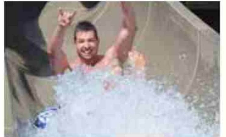
Water Slides Feature