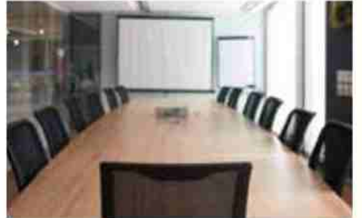
Business Center With Board Room & Audio-visual Link