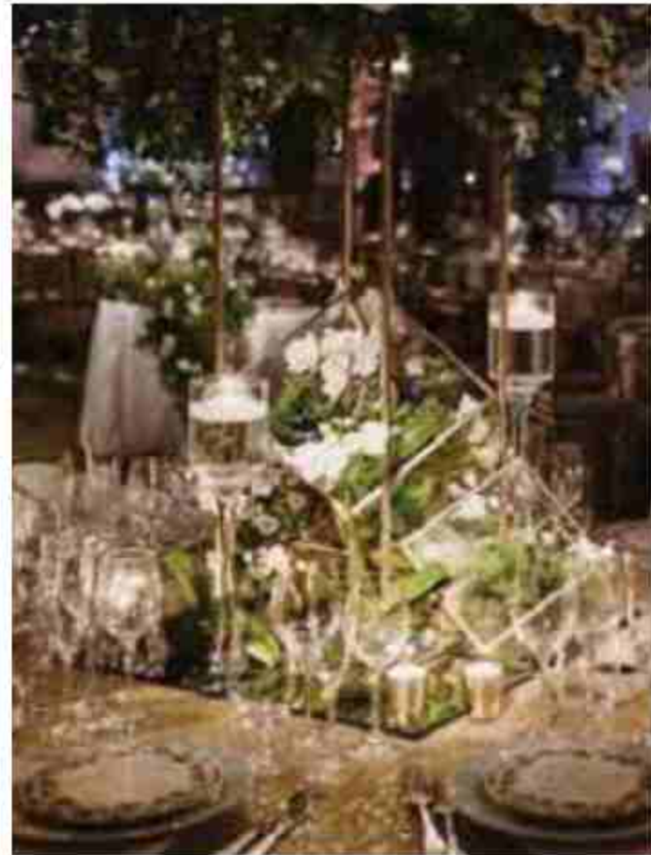
Indoor & Outdoor Banquet Hall(500 Seating)