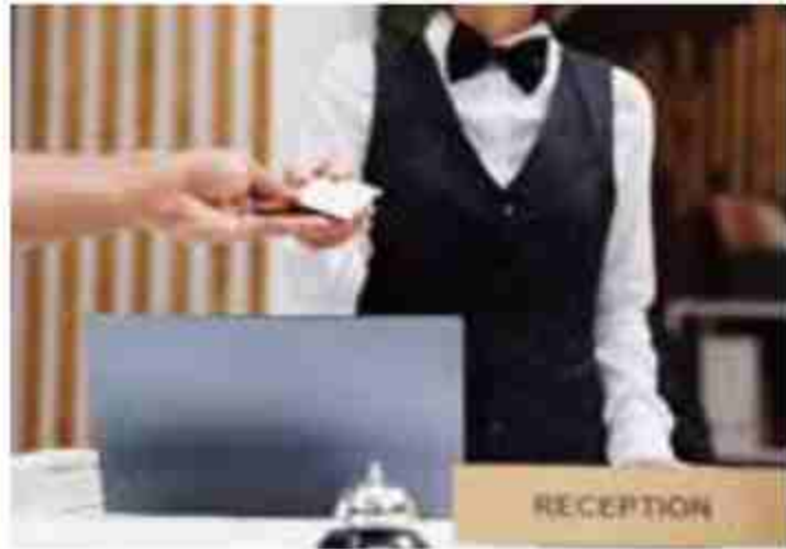
Dual Reception Lobby