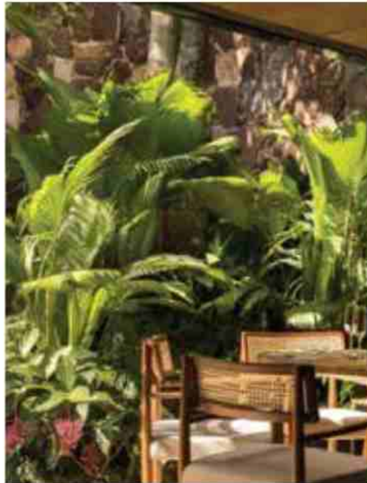
3 Restaurants (all-day, Speciality, Satvik)