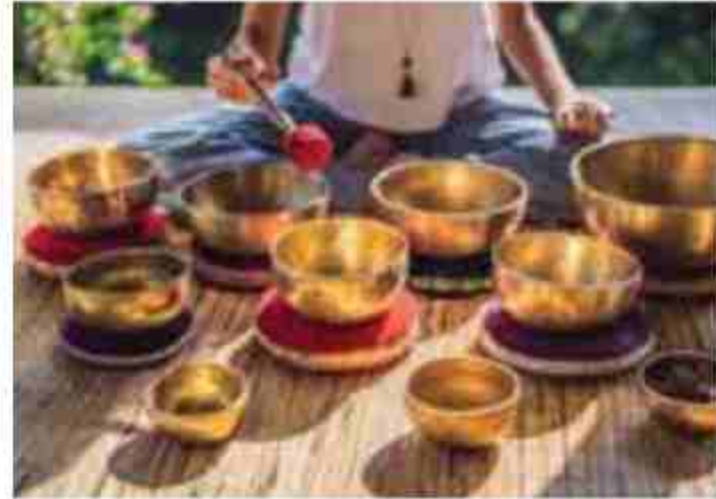
Meditation & Sound Healing Room