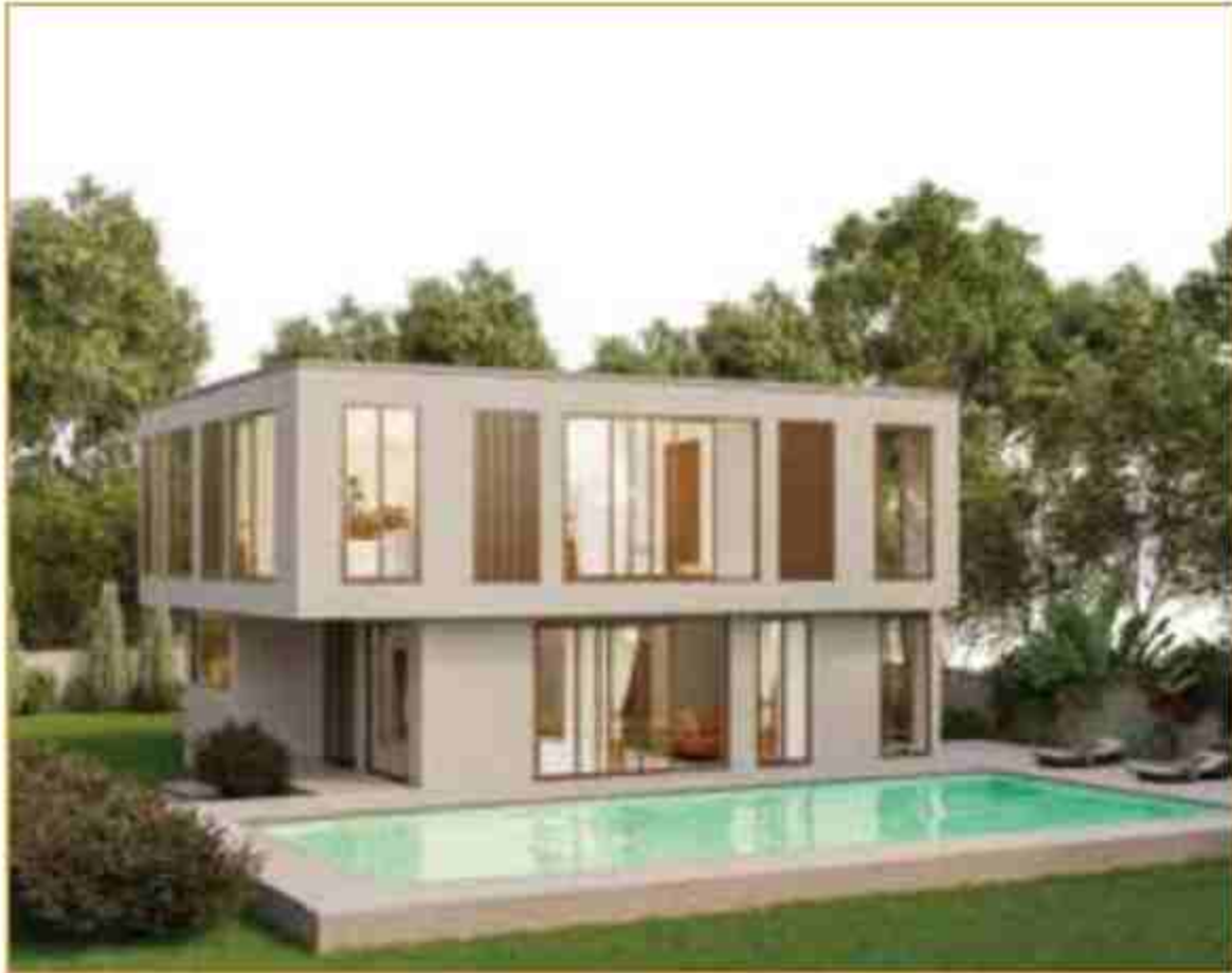
2460 sq. ft Villa - 3 BHK