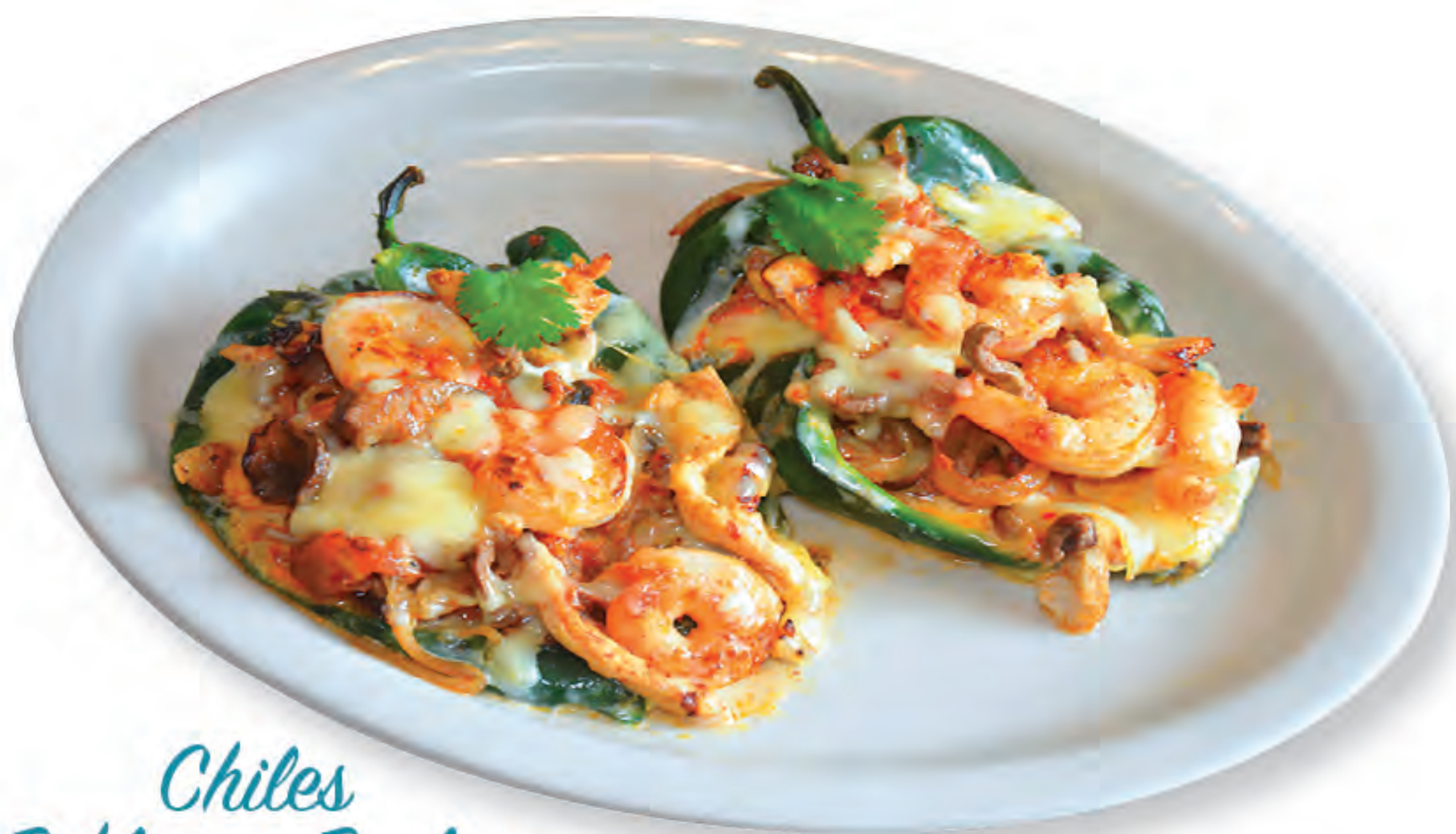
Chiles Poblanos Reales

One chicken burrito, one chicken enchilada, topped with red sauce, lettuce, sour cream, pico de gallo and guacamole. 12.99