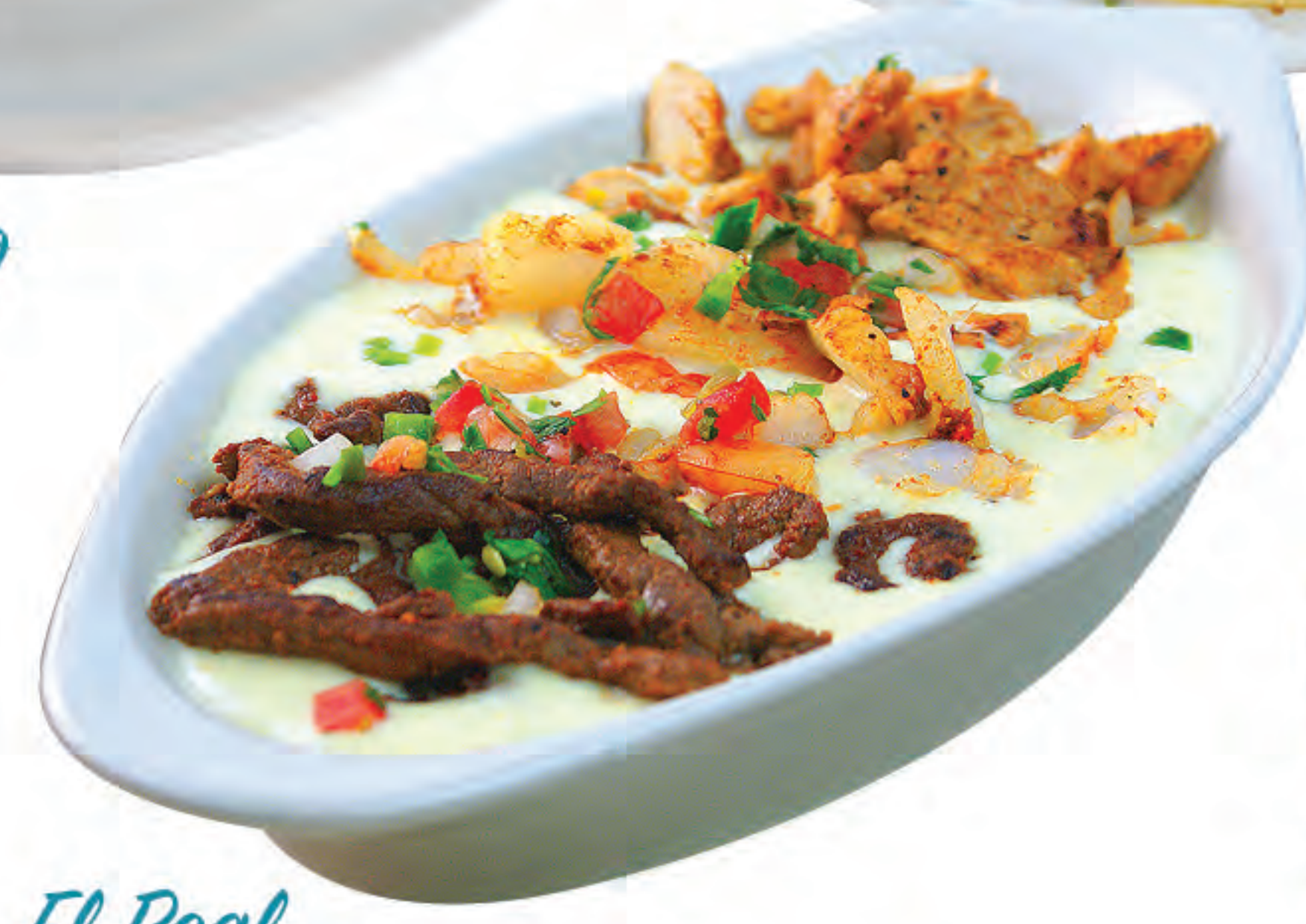
El Real Dip