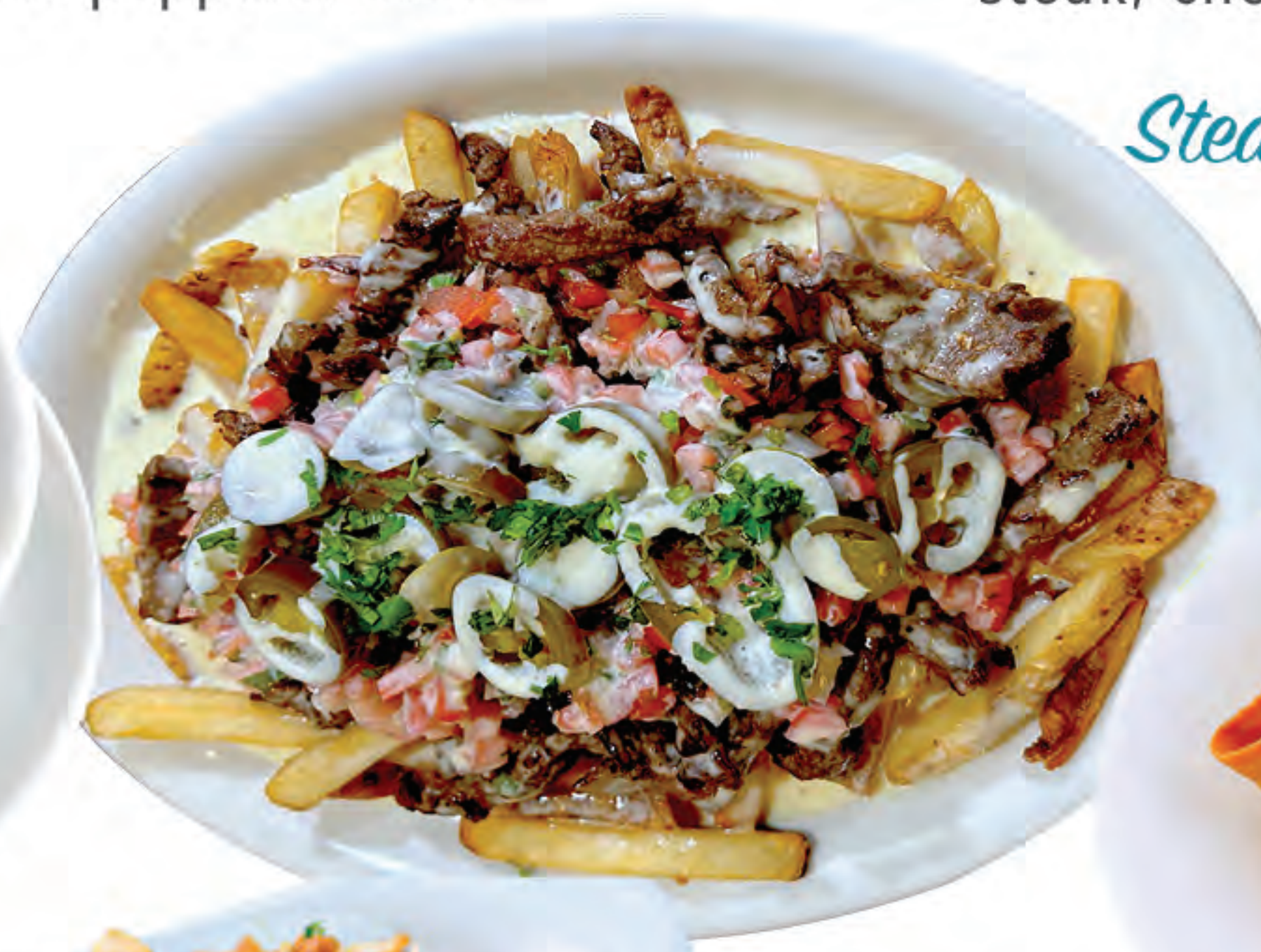
Steak & Fries