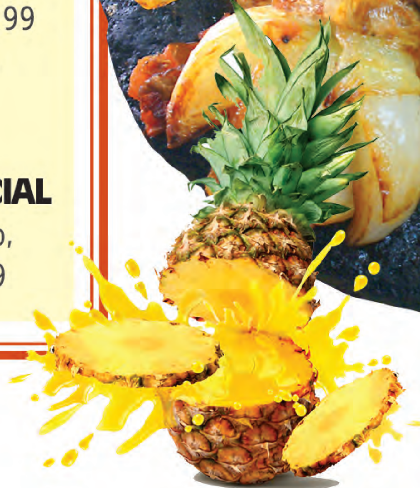
Pineapple Upon Request