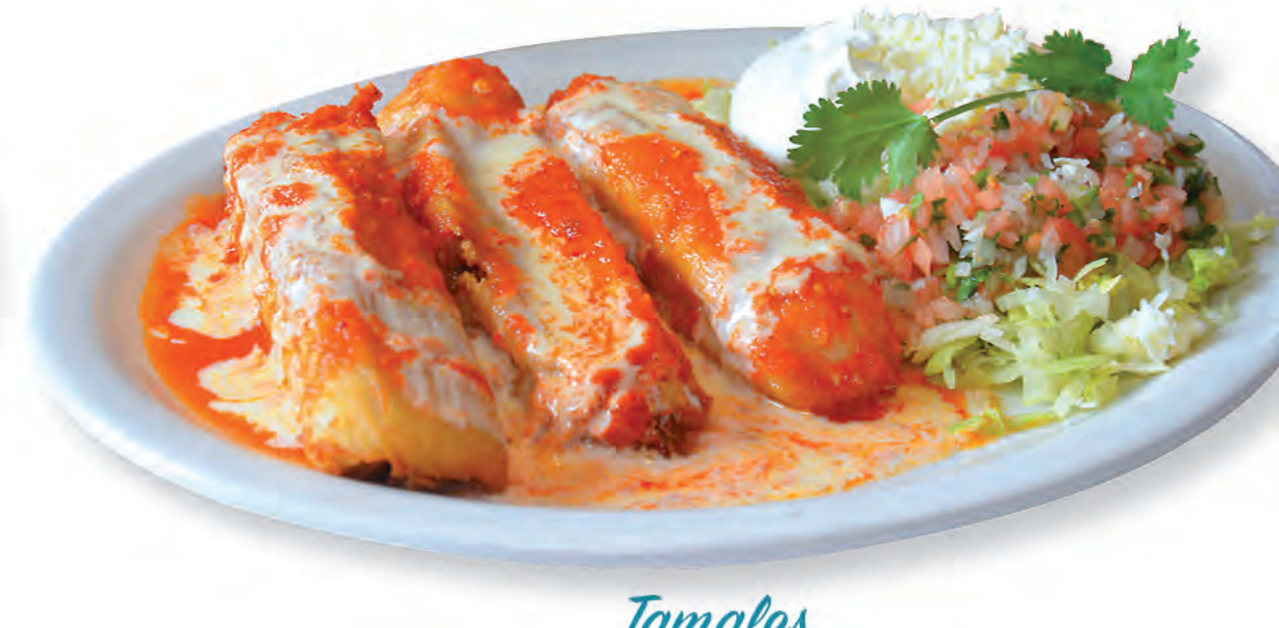
Tamales El Chilango