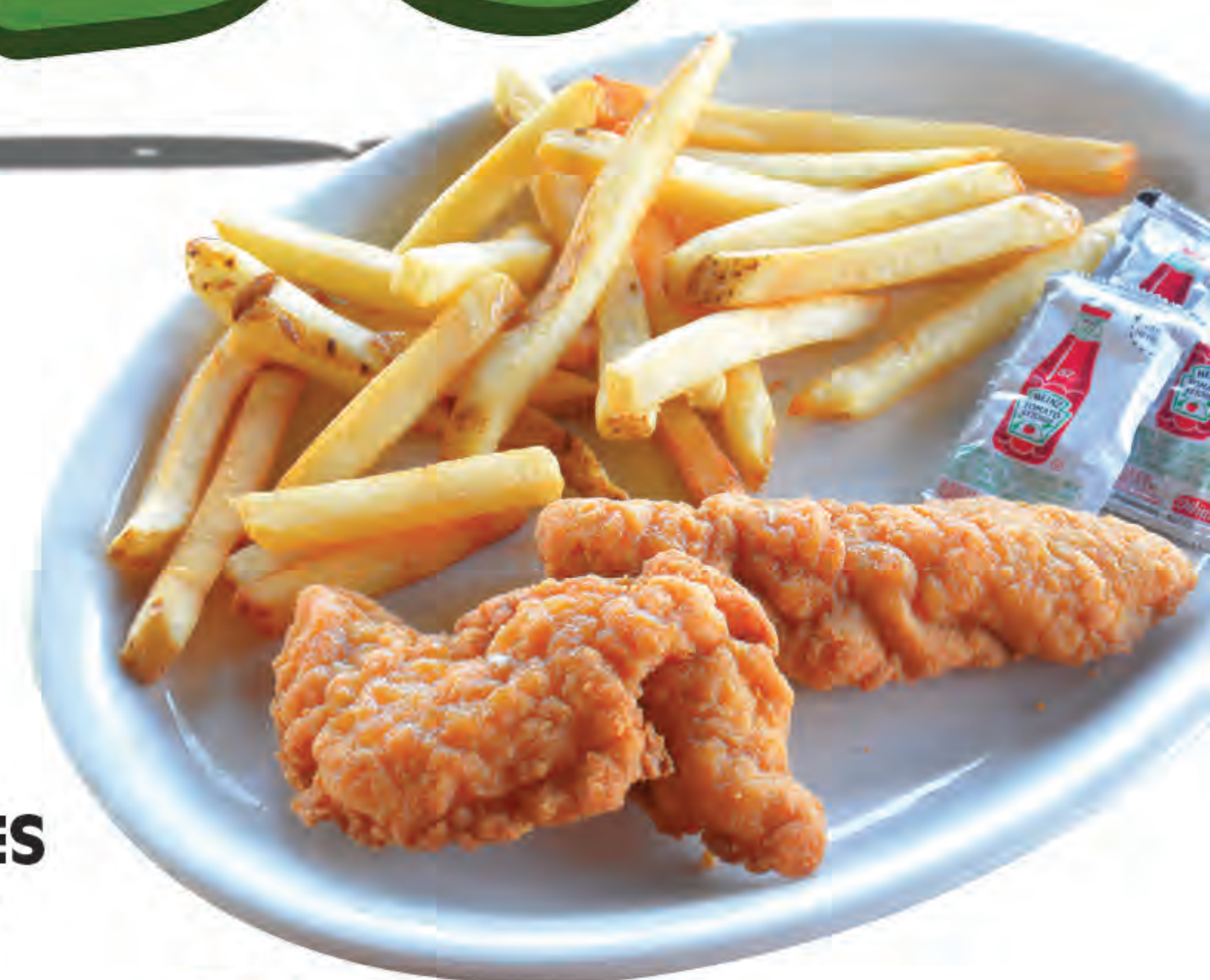
Tenders & Fries