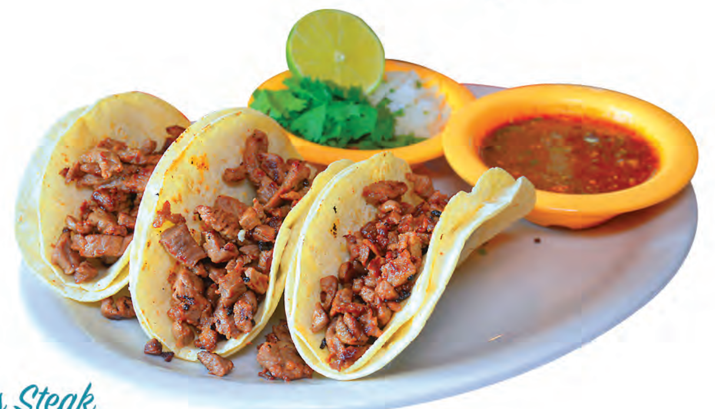
Tacos Steak Mexican Style

Three corn tortillas stuffed with shrimp, cooked with poblano peppers, onions, tomato, cilantro, cheese, and chipotle sauce. Served with rice and pico de gallo 14.99