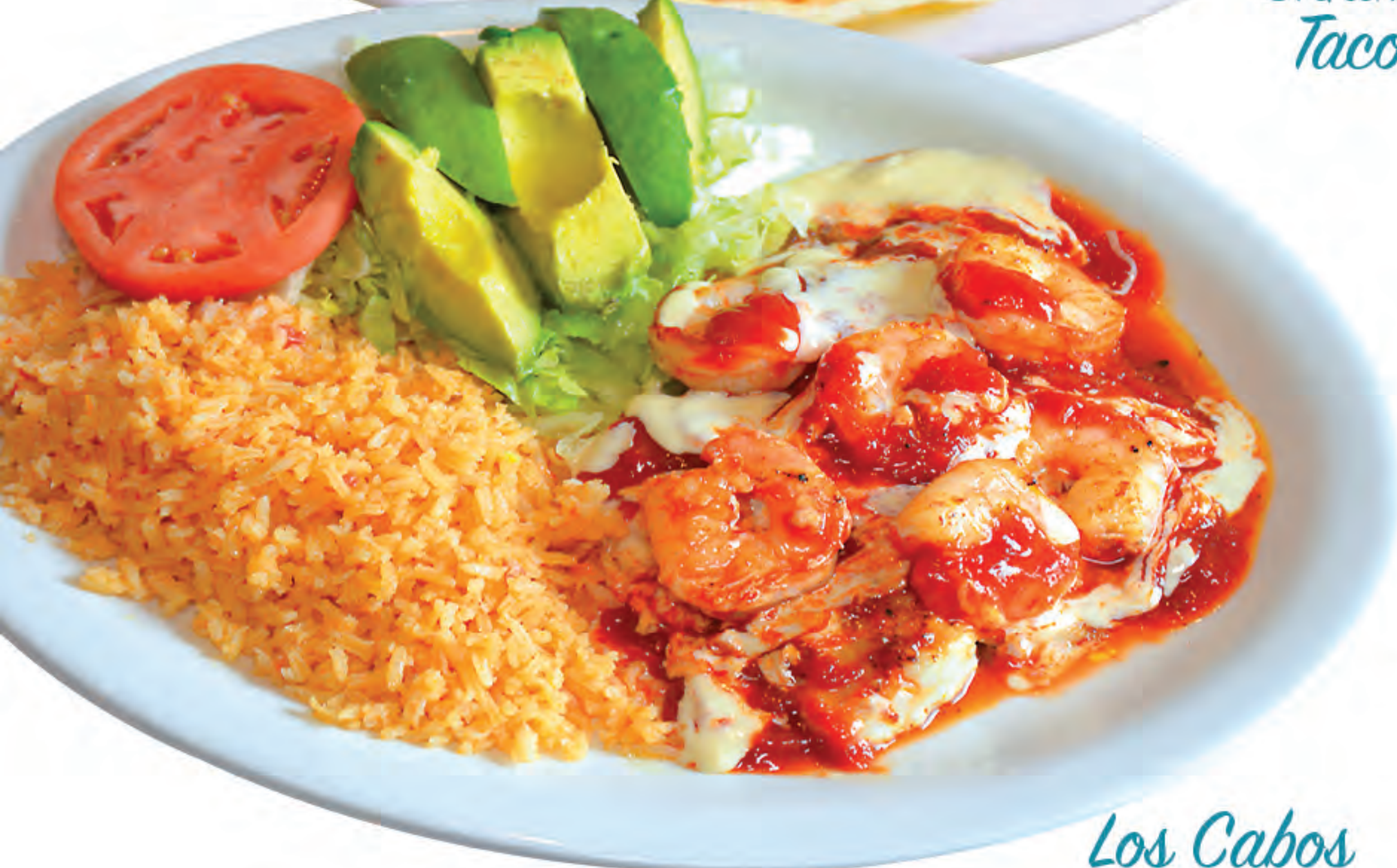
Los Cabos Special