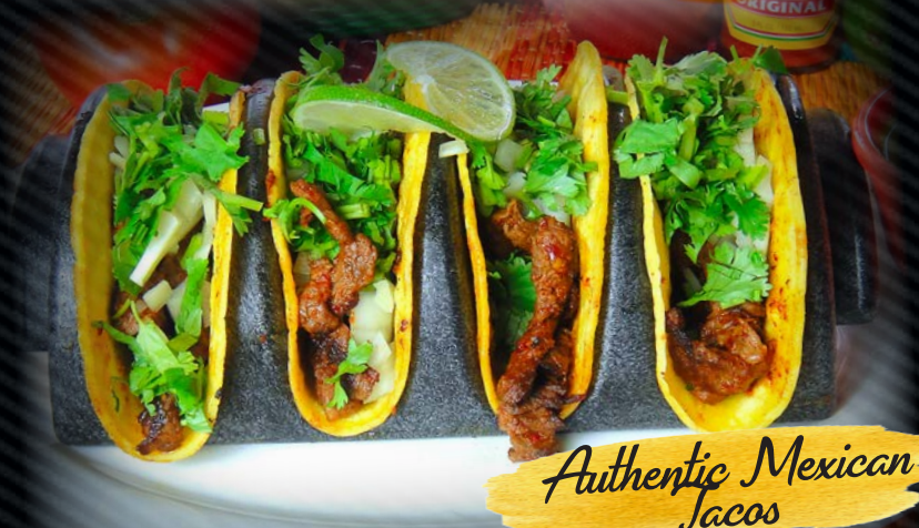
Authentic Mexican Tacos

Four corn or flour tortillas, stuffed with carne al carbon, grilled chicken, barbacoa or al pastor (marinated pork), topped with onions, and cilantro, served with a side of our special salsa 13.49