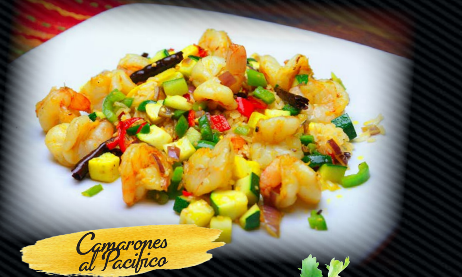
Camarones al Pacifico

A grouper filet on a bed of rice, smothered with spinach chipotle dip with shrimp. Served with Mexican salad and tortillas 14.99