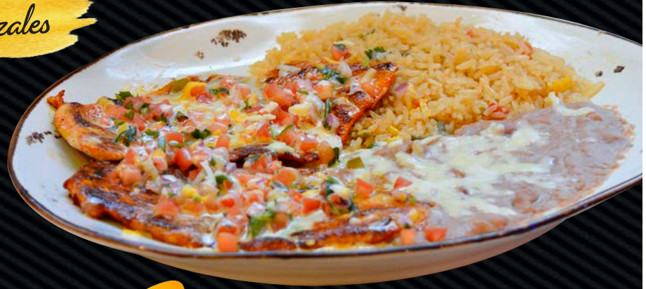
new POLLO FIESTA LUNCH Grilled chicken breast topped with pico de gallo and cheese dip. Served with rice and beans 8.99