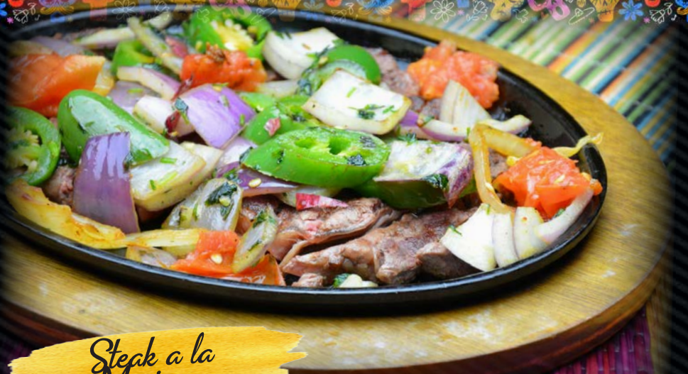
Steak a la Mexicana

Two rolled flour tortillas filled with grilled steak strips, served with beans and red sauce on top 14.99