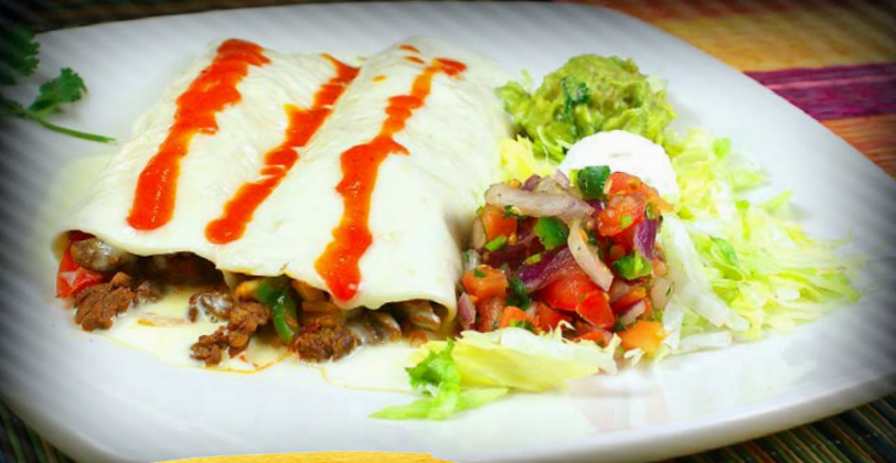
Rollos de Fajita