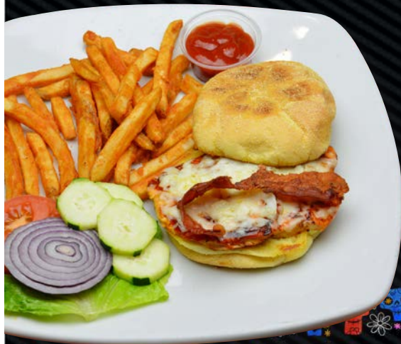
Philly Cheese Steak

*NOTICE: COOKED TO ORDER. CONSUMING RAW OR UNDERCOOKED MEATS, POULTRY, SEAFOOD, SHELLFISH OR EGGS MAY INCREASE YOUR RISK OF FOOD BORNE ILLNESS, ESPECIALLY IF YOU HAVE CERTAIN MEDICAL CONDITIONS