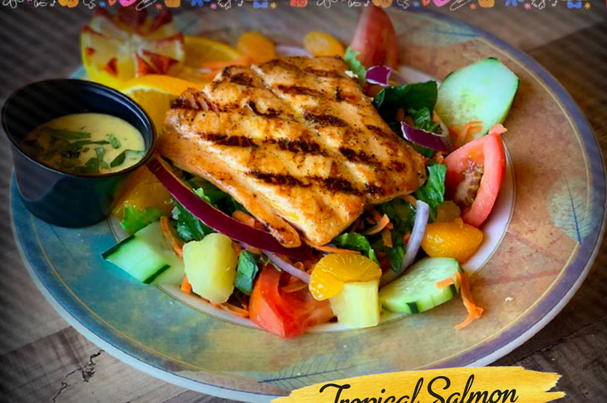
Tropical Salmon Salad