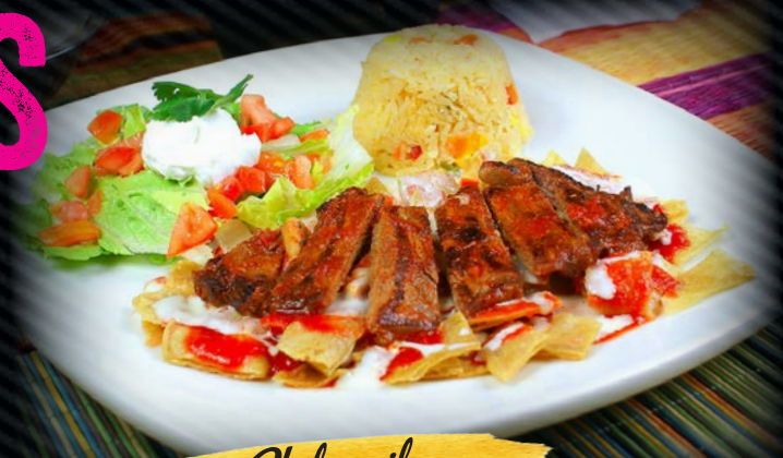
Chilaquiles Arracheros Steak

*NOTICE: COOKED TO ORDER. CONSUMING RAW OR UNDERCOOKED MEATS, POULTRY, SEAFOOD, SHELLFISH OR EGGS MAY INCREASE YOUR RISK OF FOOD BORNE ILLNESS, ESPECIALLY IF YOU HAVE CERTAIN MEDICAL CONDITIONS