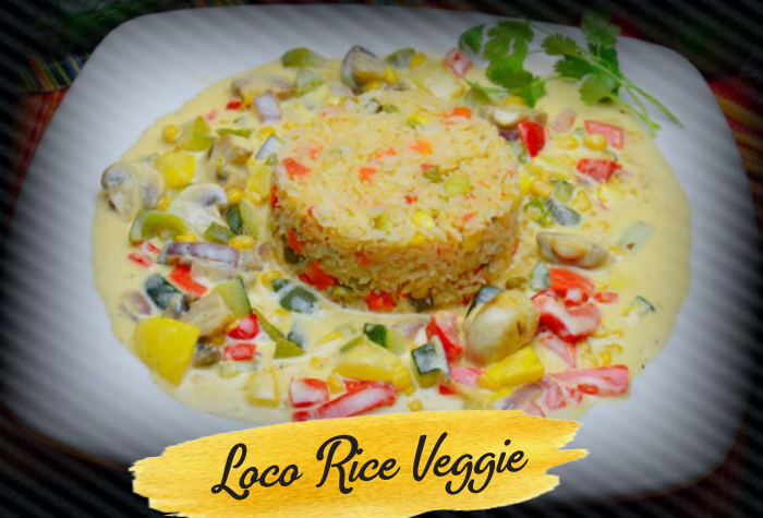
Loco Rice Veggie