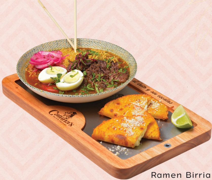
Ramen Birria Soup