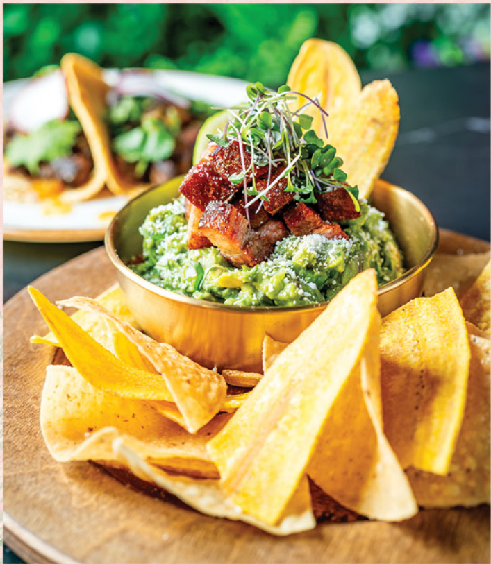
Pork Belly Guacamole