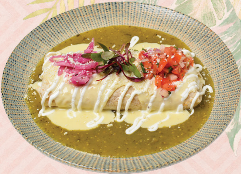
El Gordo Burrito

Big burrito stuffed with chicken, chorizo, pineapple, rice, and beans. Topped with salsa verde, cheese sauce, pico de gallo, cotija and crema 17