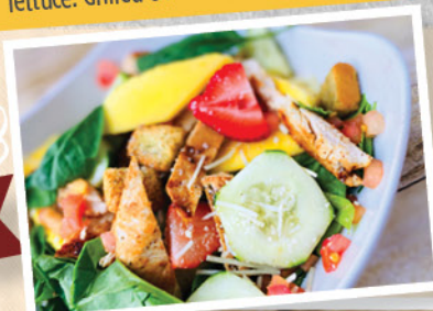
Mango and Strawberry Salad

SANTA FE SALAD – Romaine lettuce, cucumber, tomatoes, red onions, avocado, corn, black beans, parmesan cheese, and croutons. Grilled Chicken $20.95 Steak, Shrimp, or Salmon $23.95 CAESAR SALAD – Romaine lettuce, caesar dressing, croutons, and parmesan cheese. Grilled Chicken $20.95 Steak, Shrimp, or Salmon $23.95 MANGO STRAWBERRY SALAD – Romaine Lettuce, spinach, cucumber, tomatoes, parmesan cheese, croutons, mango, and strawberries. Grilled Chicken $20.95 Steak, Shrimp, or Salmon $23.95 EL COMAL SALAD – Lettuce, tomatoes, peppers, onions, cucumber, avocado, croutons, and queso fresco. Grilled Chicken $20.95 Steak or Shrimp $23.95 TOSSED SALAD – Lettuce, tomato, onion, cucumber, peppers, croutons, and shredded cheese. $9.95 TACO SALAD – A crispy flour tortilla shell filled with shredded chicken or ground beef, lettuce, tomatoes, sour cream, and cheese. $17.95 FAJITA TACO SALAD – A crispy flour tortilla shell filled with onions, pepper, tomatoes, sour cream, cheese, and lettuce. Grilled Chicken $20.95 Steak or Shrimp $23.95