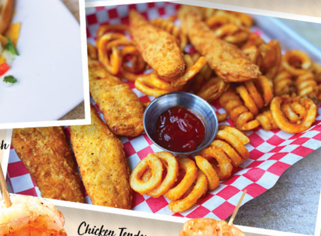
Chicken Tender Basket