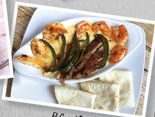
El Comal Dip