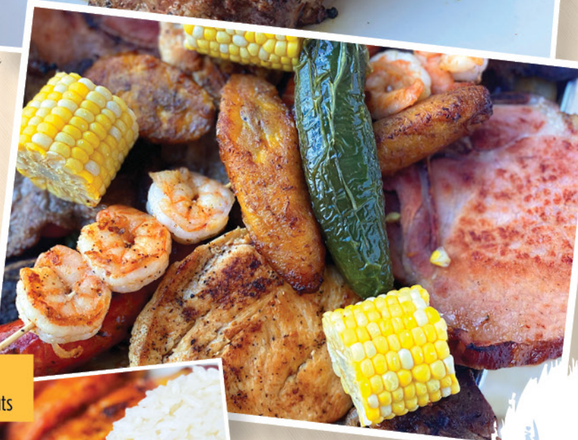
Parrillada El Comal