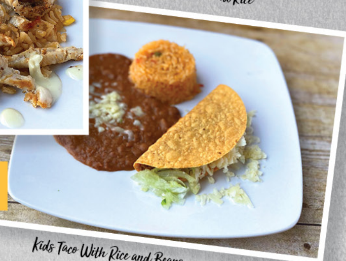
Kids Taco With Rice and Beans