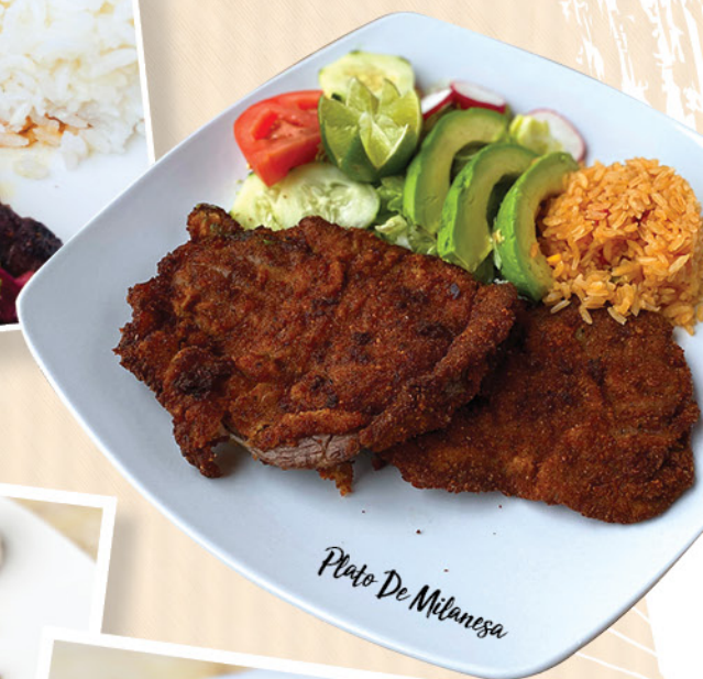
Plato De Milanesa