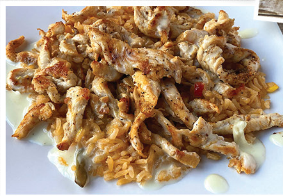
Kids Arroz con Pollo