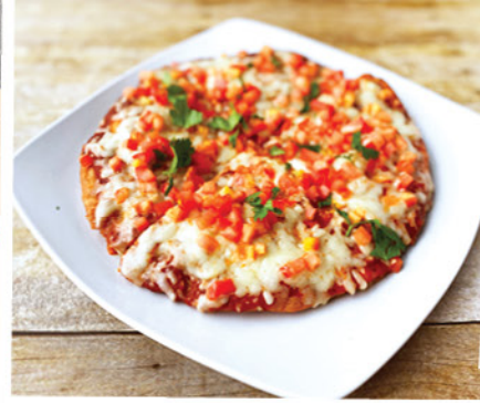
El Comal Mexican Pizza

Choice of meat. Topped with corn, pico de gallo and queso fresco. $15.95