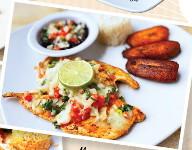
Margarita Lime Chicken