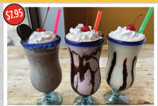
CHOCOLATE OREO STRAWBERRY VANILLA