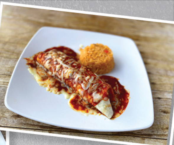
Kids Burrito and Rice

PLEASE ALLOW EXTRA TIME TO PREPARE THESE DISHES