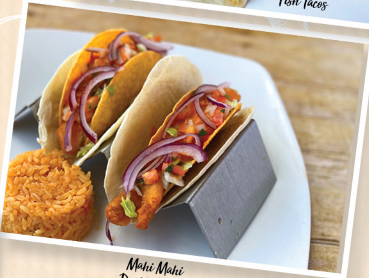
Mahi Mahi Double Decker