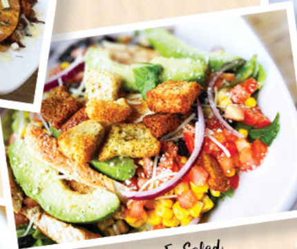
Santa Fe Salad