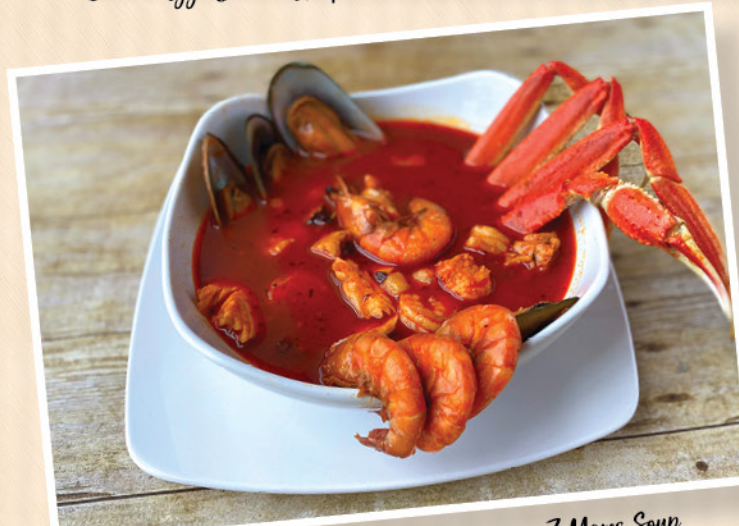
7 Mares Soup