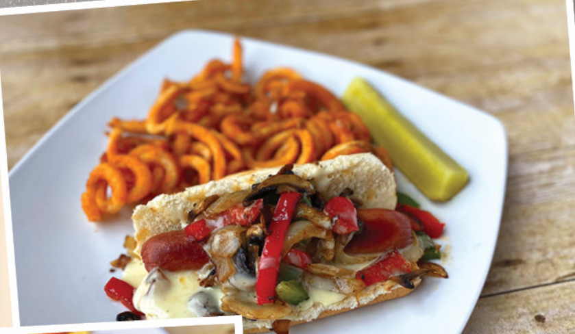
Hot Dog Loco

Chicken tenders (5) served with fries. $15.95