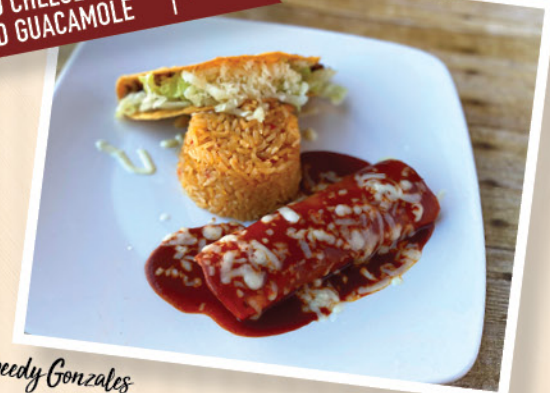
L. Speedy Gonzales