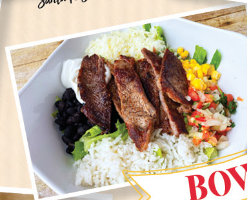
Bowl From The South