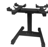
Premium Adjustable Dumbbell Stand