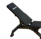
Premium Sturdy Exercise Bench