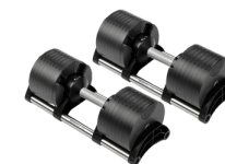
Premium Adjustable Dumbbell

This picture above is for illustration purposes only