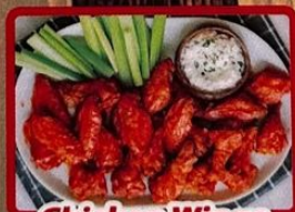
Chicken Wings 9.99