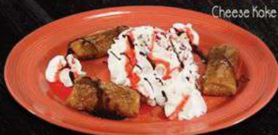
Cheese froke Chimi