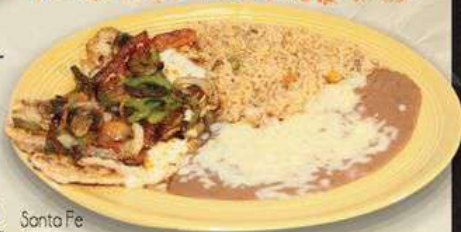
Santa Fe Chicken

Grilled chicken and mango with lettuce, tomatoes, onions, green peppers and cheese 11.15