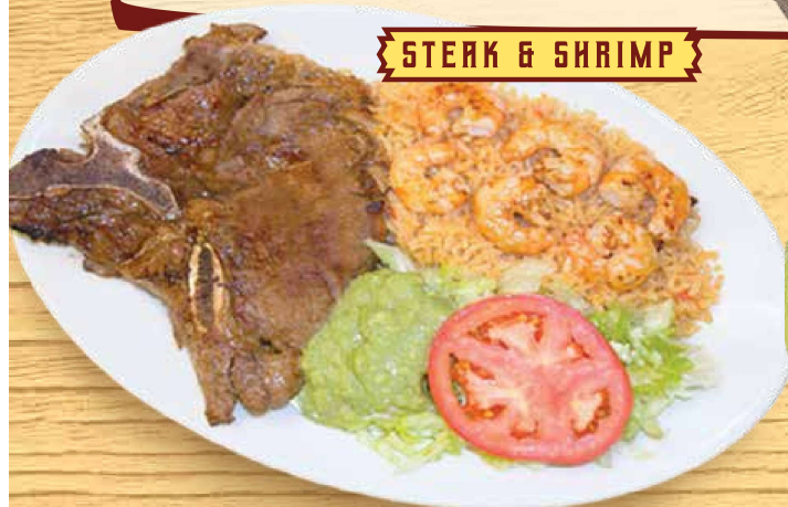
STEAK & SHRIMP