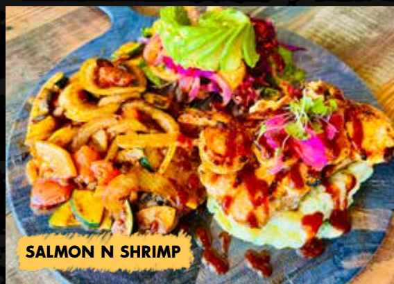
SALMON N SHRIMP