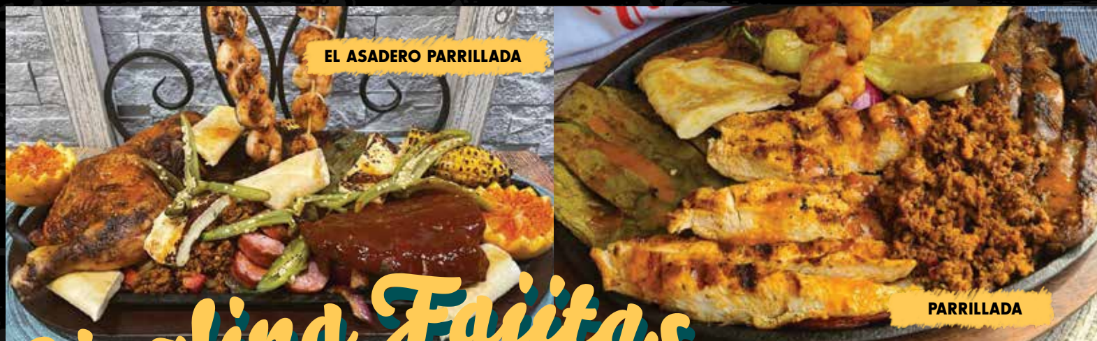
EL ASADERO PARRILLADA