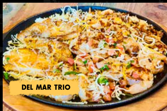
DEL MAR TRÍO