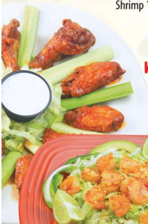
CHICKEN WINGS (10) 12.49