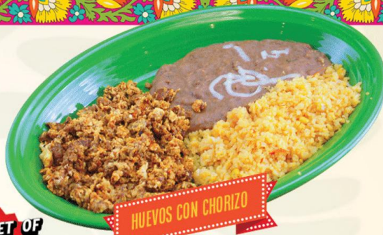
HUEVOS CON CHORIZO

FIRST BASKET OF CHIPS AND SALSA ON US SECOND ORDER $1.75 EXTRA