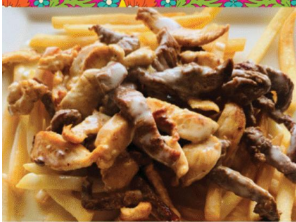
RANCHO FRIES French fries topped with steak, grilled chicken and queso dip 14.99