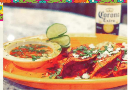
QUESABIRRIA Three corn tortillas stuffed with cheese and shredded beef, topped with fresh cilantro and onions, served with a cup of its own beef broth 15.50