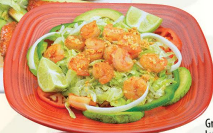
SHRIMP SALAD Grilled shrimp served on a bed of lettuce, onions, avocado, tomato, bell peppers and shredded cheese on top. 14.99