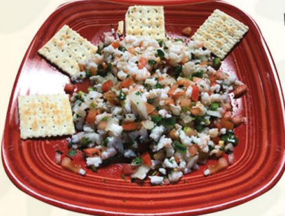
CEVICHE Shrimp cooked in lime juice mixed with pico de gallo. 15.49