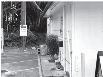
RV Dump Station

We would recommend a side of corn bread that would go along perfectly with this meal. Enjoy!