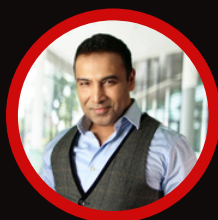
AYUB SHAIKH @ayubshaikh