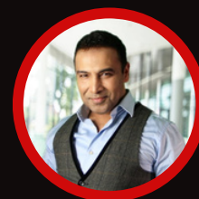
AYUB SHAIKH @ayubshaikh