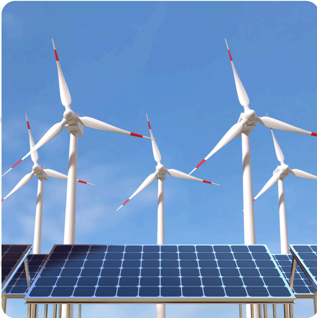
Renewable Energy Investments