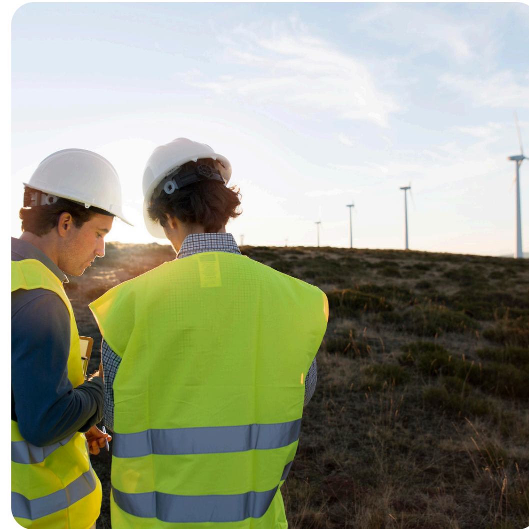
Streamline Mining Solutions