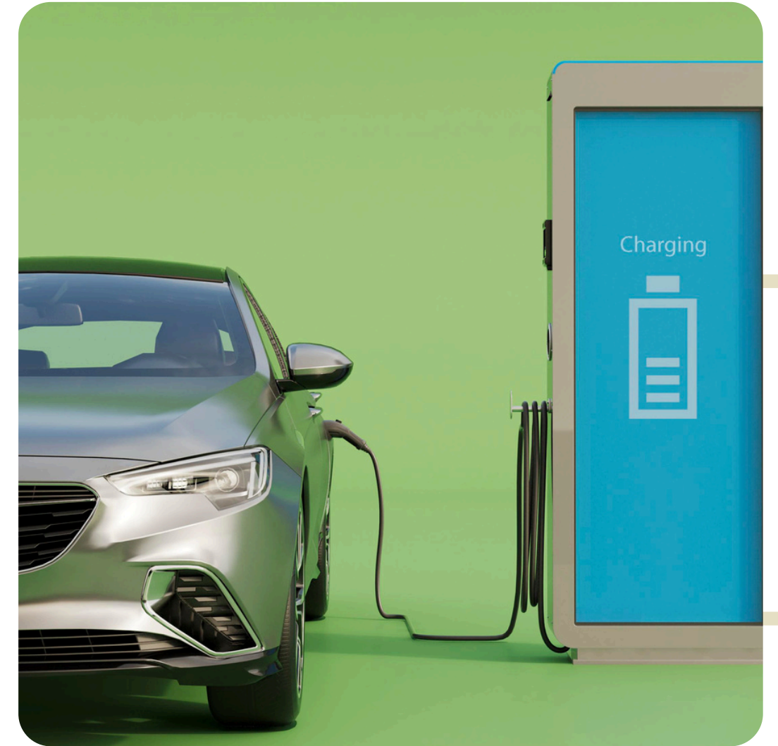
Electric Mobility & Charging Infrastructure