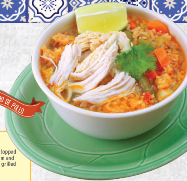
CALDO DE POLLO

SERVED EVERYDAY BETWEEN 11:00 A.M. AND 3:30 P.M.