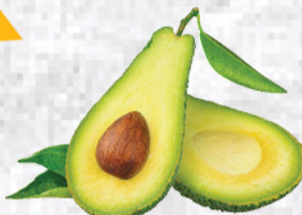
GUACAMOLE MEXICANO Made table side