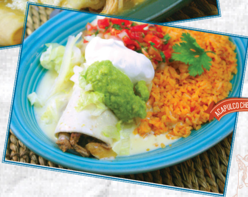
ACAPULCO CHEESE STEAK