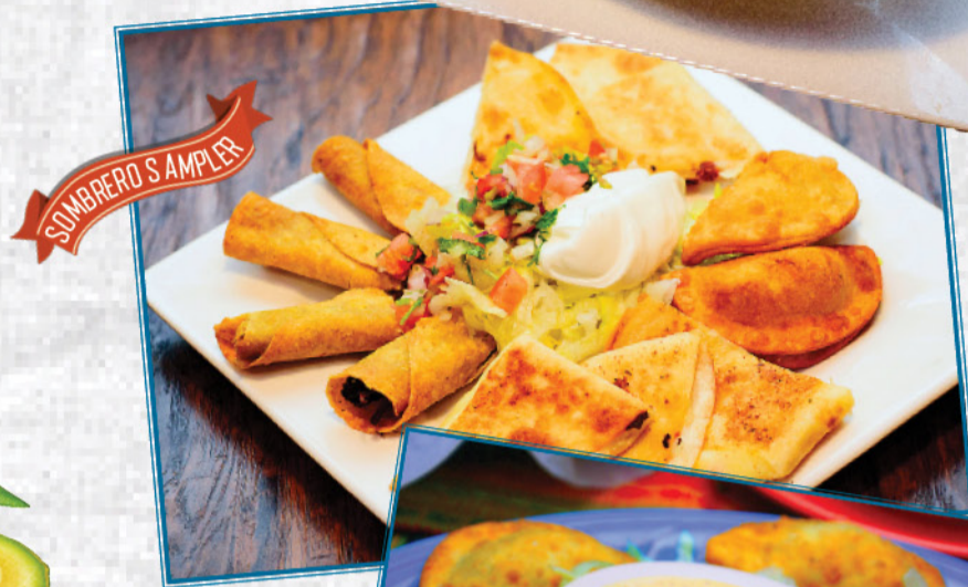
SOMBRERO S AMPLER